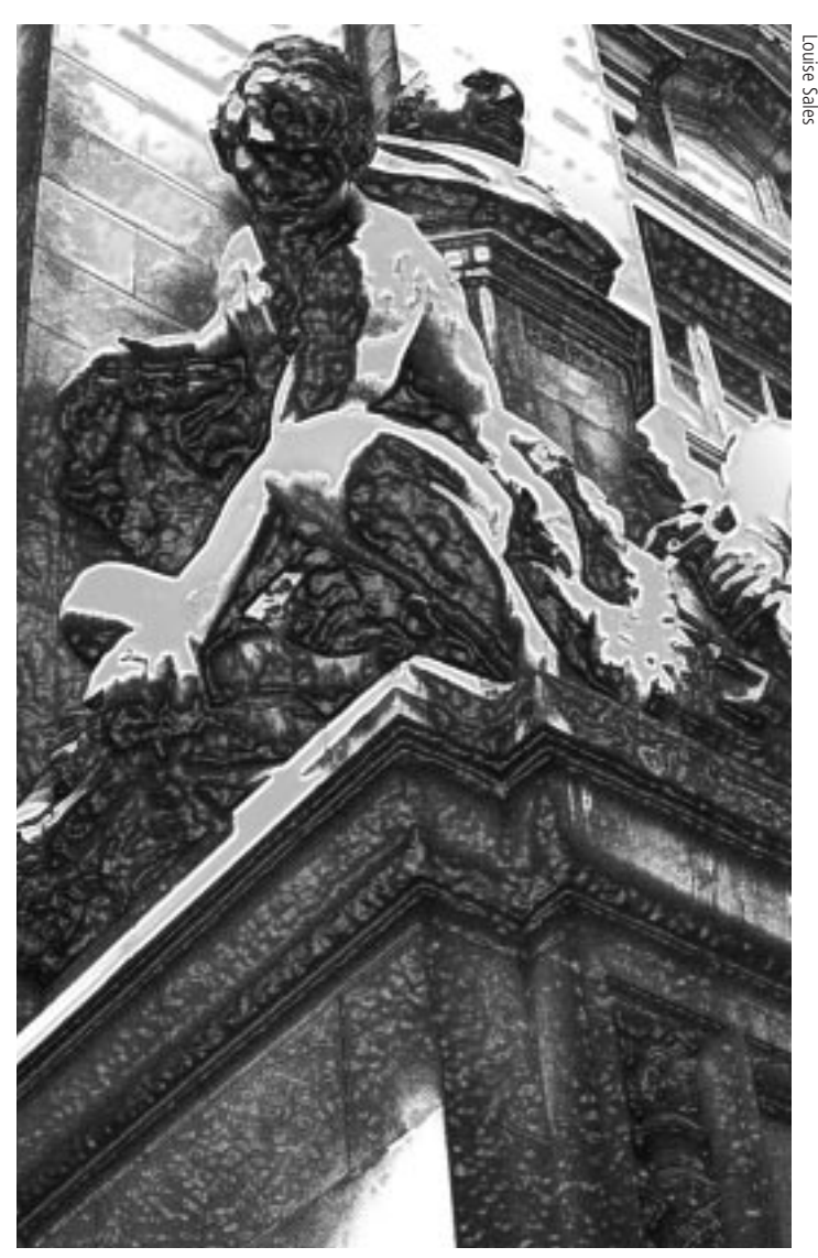
Sculpture on wall of key oil centre the Royal School of Mines at Imperial College, London – blackened from car exhaust fumes

After detailing the ways in which the research and teaching agendas are influenced by oil companies, the report makes a series of recommendations to put universities onto a more sustainable path.