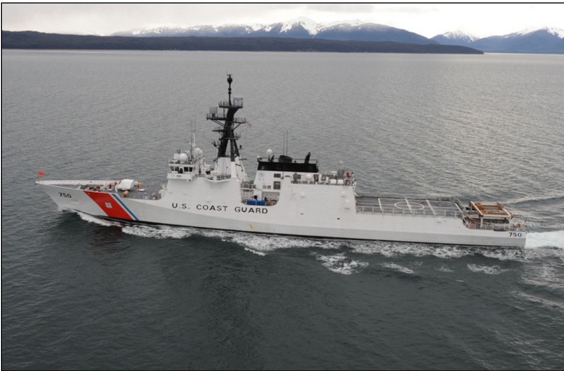
Figure 1. National Security Cutter