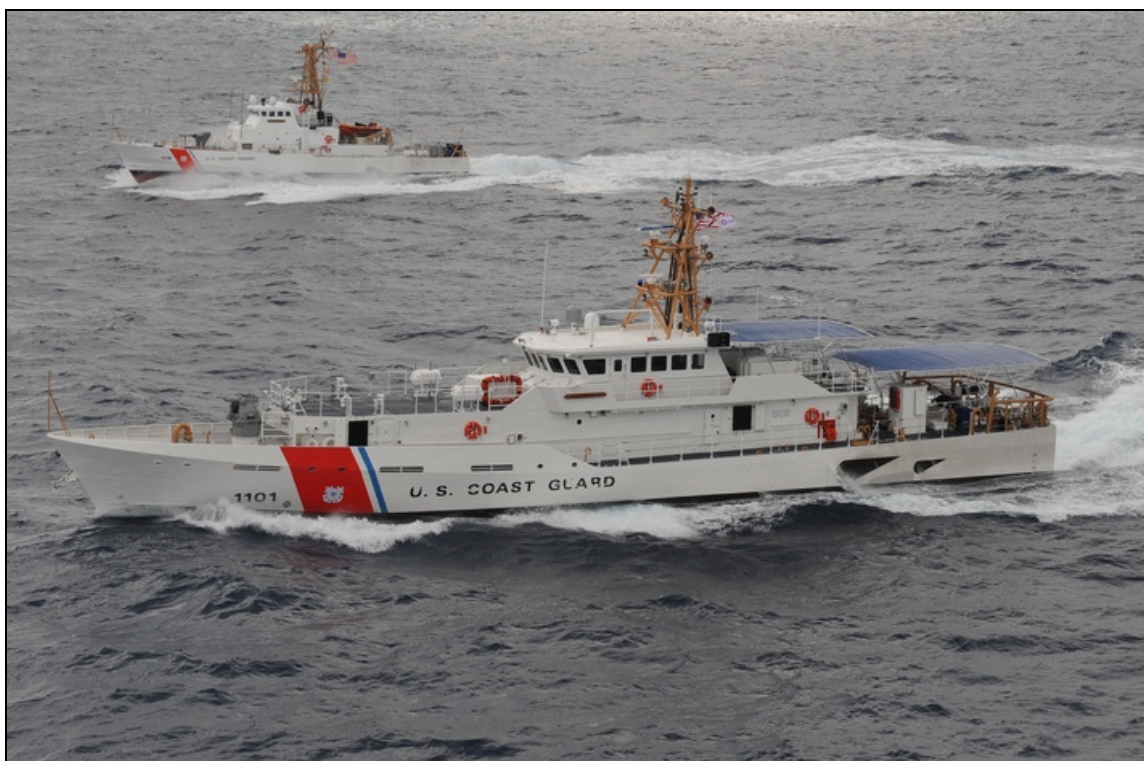
Figure 3. Fast Response Cutter (With an older Island-class patrol boat behind)