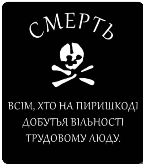
Flag of the Makhnovists with its motto, "Death to all who stand in the way of freedom for working people!"