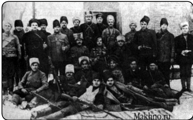
Photo taken at a Makhnovist meeting

uphold insurrectionist voluntarist putschism or alternativist communalism? None, individuals maybe, but such strains have long been superseded as credible alternatives by serious mass anarchists. As a contending force there are no Galleanists or Proudhonists in the ranks of such organisations. At least I do not see any from my vantage point. This leaves the mass self-organisation and management of struggle, syndicalist methods, as the strategy of most serious anarchists seeking a revolutionary transformation to libertarian communism.