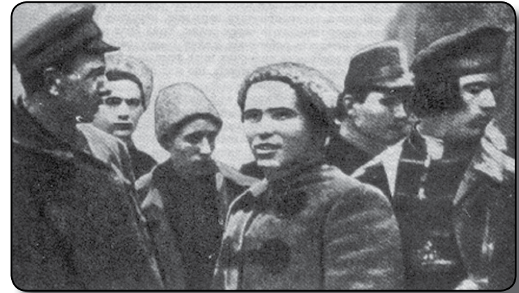
Makhno and his officers during the revolution in the Ukraine