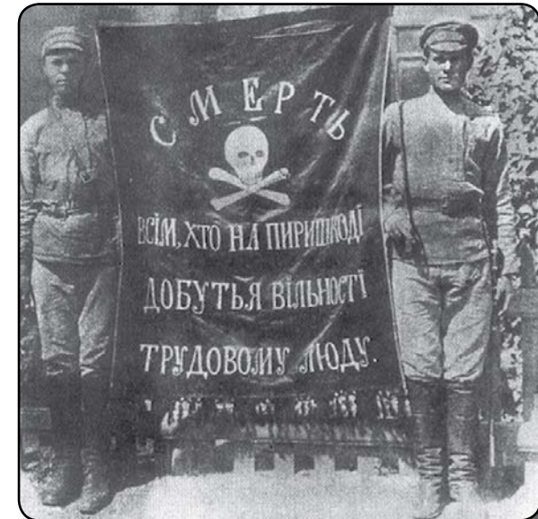
Makhnovists with a Revolutionary Insurrectionary Army of the Ukraine (Makhnovist) banner