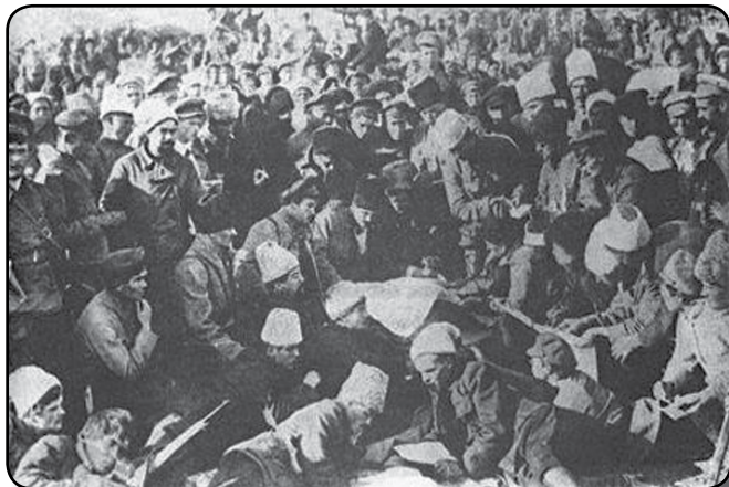
Makhnovist Army, ca. 1919, planning their next move