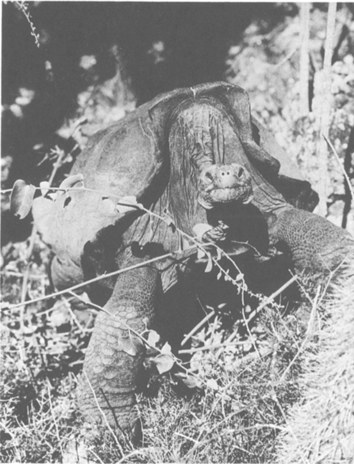
Fig. 2. The Hood Island tortoise ( Geochelone elephantopus hoodensis ), an extreme saddleback form similar to the now-extinct Charles Island race ( G. elephantopus galapagoensis ).

Island, where the vice-governor was residing. The Charles Island tortoise, like the nearby Hood Island variety, has its shell turned up in front like a Spanish saddle. This is an adaptation found on the smaller and drier islands, allowing the tortoise to stretch its neck much higher in search of food (Fig. 2). At the time of the Beagle's visit to Charles Island, this distinctive saddleback tortoise was nearly extinct, and apparently no live ones were seen by Darwin or FitzRoy. Nevertheless, Darwin did