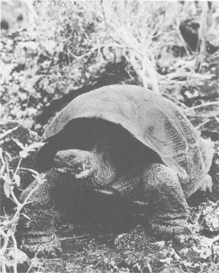
Fig. 1. The Chatham Island tortoise ( Geochelone elephantopus chathamensis ), a relatively dome-shaped form, Photographed by the author in the interior of northeastern Chatham Island.

Darwin's attitude toward the reported differences among the tortoises was reinforced by one other circumstance that has gone unrecognized in connection with his visit to the Galapagos. The first island Darwin visited, and the place where he saw his first tortoise, was Chatham Island (Fig. 1). From there the Beagle proceeded to Charles