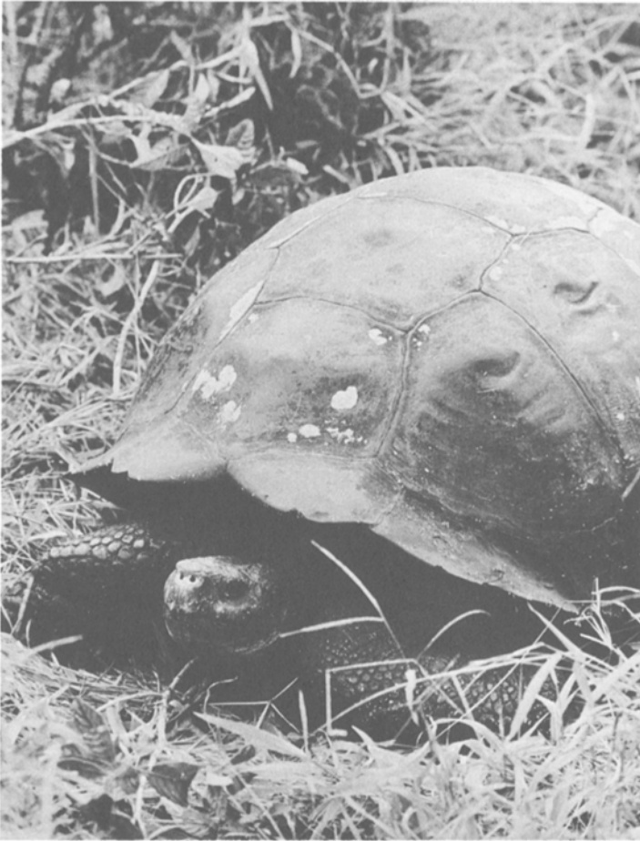
Fig. 3. The James Island tortoise ( Geochelone elephantopus darwini ), a dome-shaped form. Photographed by the author in the highlands on James Island.