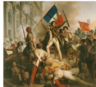
Below: a scene from the French Revolution by Jean-Victor Schnetz