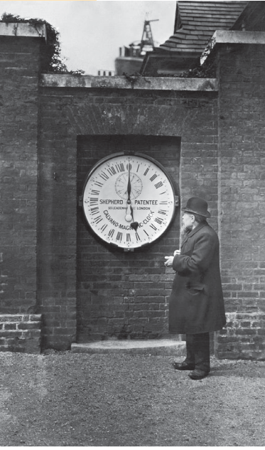
Above: the Shepherd Gate Clock, mounted outside the Royal Greenwich Observatory, showing Greenwich Mean Time

2:37PM (LONDON), 2:37PM (BRISTOL), 22 SEPTEMBER, 1847