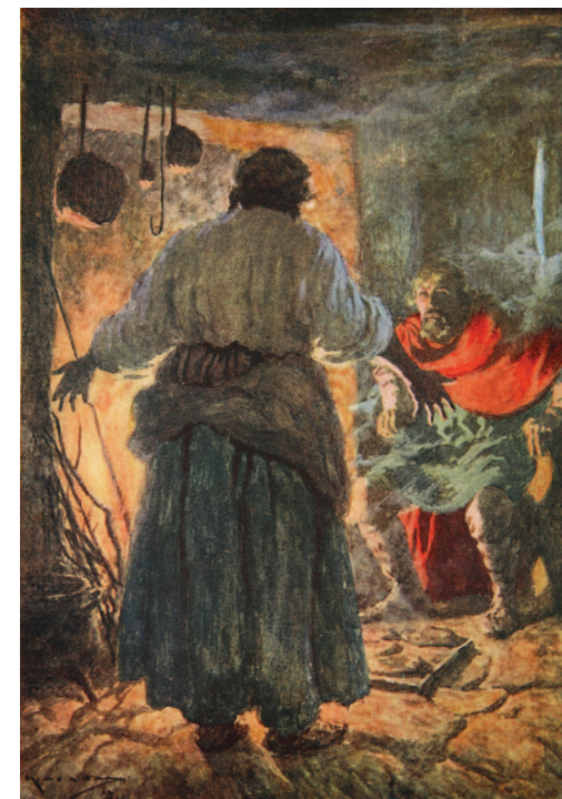
Left: an illustration by AC Michael of King Alfred burning the cakes