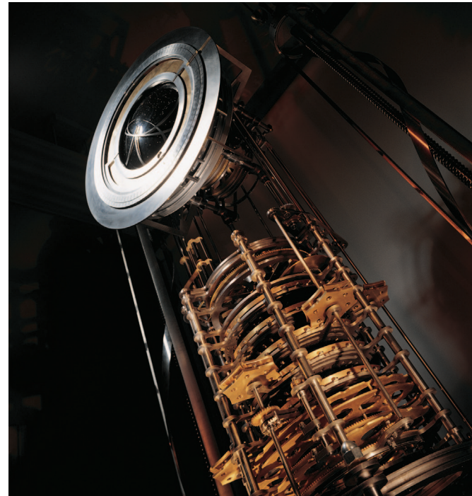
Above: a prototype of the 10,000 Year Clock, currently being assembled inside a mountain in Texas

Until surprisingly recently, time was set by the sunrise. Which was fine until the railways ushered in the era of high-speed cross-country travel. In Britain, for instance, if you got on a train in London, by the time you travelled west to Bristol your pocket watch would be 10 minutes fast. This caused havoc, so in 1840 the Great Western Railway introduced standardised London time across its network. This was met by some stiff opposition locally – some stations even added a second minute hand to their clocks to display both times. However, in 1847 the central Railway Clearing House decreed that Greenwich Mean Time should be used throughout the railway system. It still couldn't make the trains run on time.