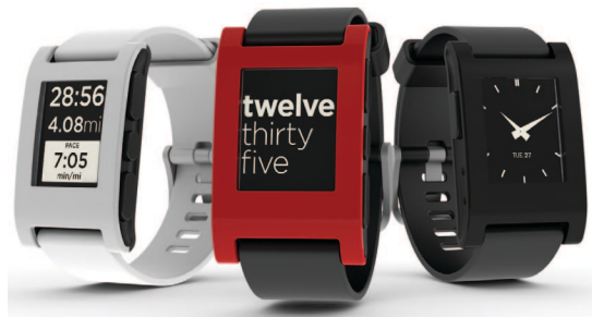
Above left: three models of the Pebble watch, which raised $10m in investment capital via the internet

With a double bong, the first prototype of the 10,000 Year Clock heralded the millennium. Now ticking very slowly in London's Science Museum, this was a trial run for an astonishing project: a clock, buried inside a remote Texas mountain, built to run for 10,000 years. Funded by Amazon billionaire Jeff Bezos and led by inventor and scientist Danny Hillis, the team from San Francisco are excavating the site and building the huge mechanism, which will be powered by thermal energy and human visitors (if indeed there are any in 10,000 years time). Made to self-adjust, never need lubrication, and resist corrosion for an almost unimaginably long time, this is futuristic in the most extreme sense of the word.