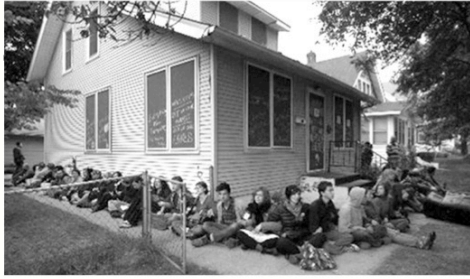
Eviction defence, Occupy Minneapolis, 2012

DEBT IS THE TIE THAT BINDS THE 99%. We must transform our failed economic system that impoverishes millions while destroying the ecosystem. Using a diversity of tactics that includes a Rolling Jubilee, a People's Bailout, and vigorous organizing towards a debt strike, Strike Debt seeks to abolish debt as it currently exists and reconstruct a just society where our debts and bonds are to one another and not the 1%. The 99% are forced into debt to pay for basic social needs like education, housing, and healthcare while the 1% profits. We can no longer afford our own oppression. We are citizens, homeowners, renters, teachers, students, parents, children, debtors, and defaulters who don't owe the banks anything. We owe each other everything.