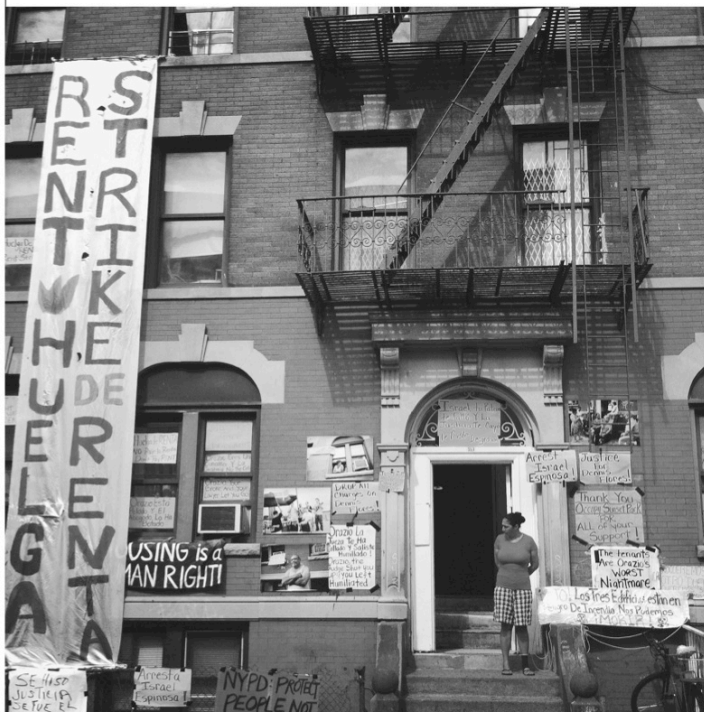
Rent Strike, Sunset Park, Brooklyn 2012.

It's time to take action. Join the resistance. ■