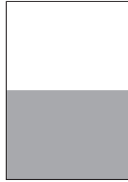
4 modules high Code: T44 Size mm: 186x260

Sat: $16,072.60 ($17,679.86 incl. GST) Sun-Fri: $12,724.85 ($13,996.62 incl. GST)