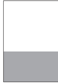
3 modules high Code: T34 Size mm: 139x260

Sat: $12,858.08 ($14,143.88 incl. GST) Sun-Fri: $10,179.36 ($11,197.29 incl. GST)