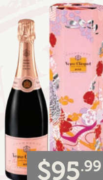
Veuve Clicquot Shakkei Rose Brut NV