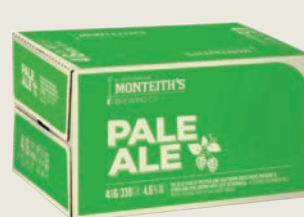
Monteiths Pale Ale