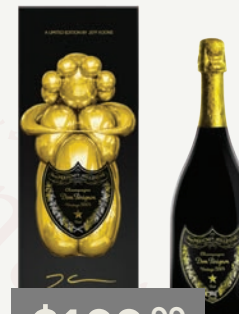
Dom Perignon 2004 by Jeff Koons