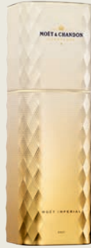
Moët & Chandon Brut Impérial Glimmer Chiller Champagne, France NV

Moët & Chandon has yet again delivered a unique gift offer for the festive season. The Glimmer Chiller is an elegant, re-useable diamond design metal box that will keep your wine chilled for up to two hours. This is a stunning gift for clients or friends.