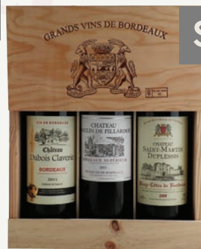
Grand Vin de Bordeaux Bottle Pack