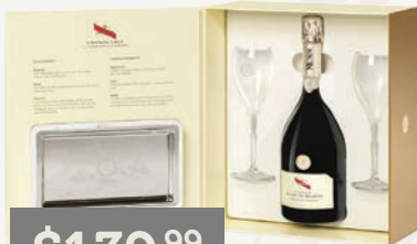
G.H. Mumm de Cremant Blanc de Blancs NV with 2 Flutes