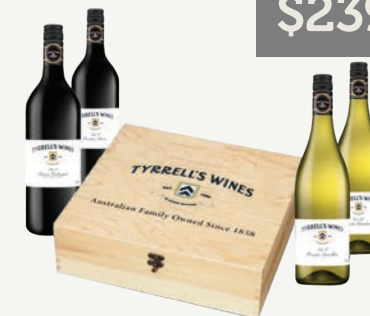
Tyrrell's Vat Range Gift Box