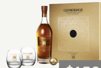
Glenmorangie 18 Year Old Golf Gift Pack