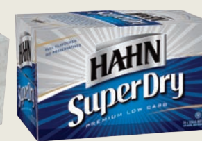
Hahn Super Dry