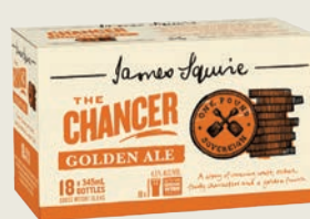
James Squire The Chancer