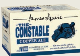
James Squire The Constable