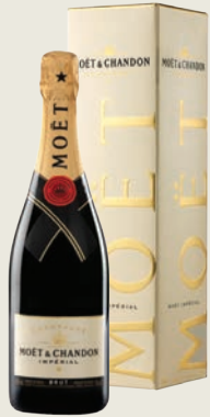
Moët & Chandon Brut Impérial Champagne, France NV

Moët & Chandon's most iconic Champagne, Brut Impérial NV comprises over 100 different wines blended together to form this renowned house style. With its citrus and lime blossom aromas and a hint of brioche on the palate, it is well balanced with a light freshness, perfect for every celebration.