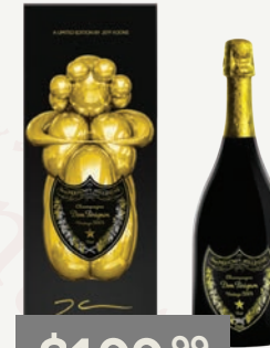
Dom Perignon 2004 by Jeff Koons