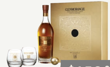
Glenmorangie 18 Year Old Golf Gift Pack