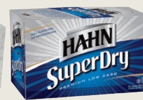
Hahn Super Dry