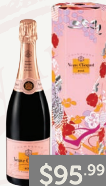
Veuve Clicquot Shakkei Rose Brut NV