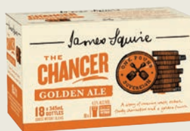
James Squire The Chancer