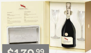
G.H. Mumm de Cremant Blanc de Blancs NV with 2 Flutes