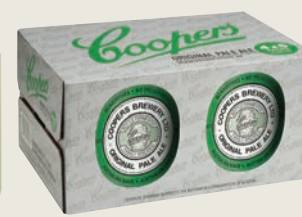
Coopers Pale Ale