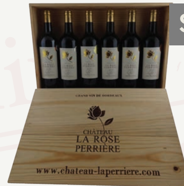
Right Bank Vertical Collect