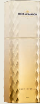
Moët & Chandon Brut Impérial Glimmer Chiller Champagne, France NV

Moët & Chandon has yet again delivered a unique gift offer for the festive season. The Glimmer Chiller is an elegant, re-useable diamond design metal box that will keep your wine chilled for up to two hours. This is a stunning gift for clients or friends.