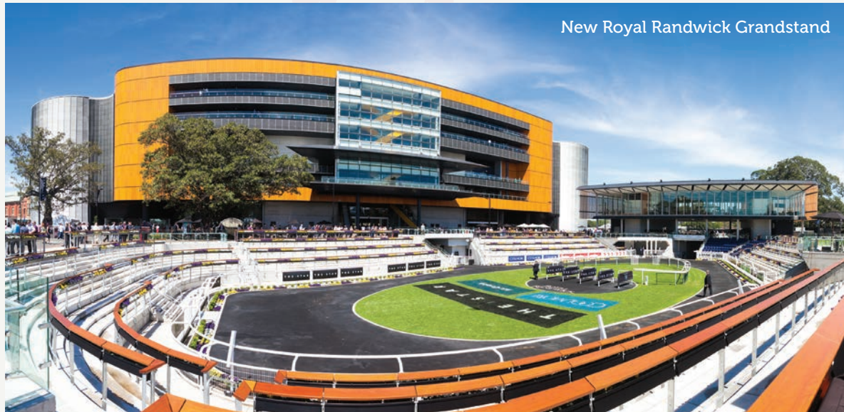
New Royal Randwick Grandstand