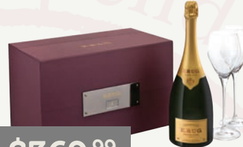
Krug Sharing Set Krug Grande Cuvee NV with two Riedel flutes