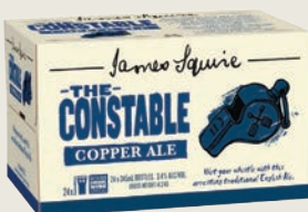
James Squire The Constable