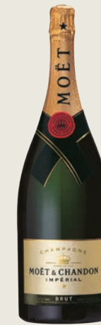
Moët & Chandon Brut Impérial 1.5L Magnum Champagne, France NV

Brut Impérial is the world's biggest selling Champagne and popping a magnum of its iconic bubbles will be the highlight at your next celebration. It is also an incredible gift for your clients or colleagues.