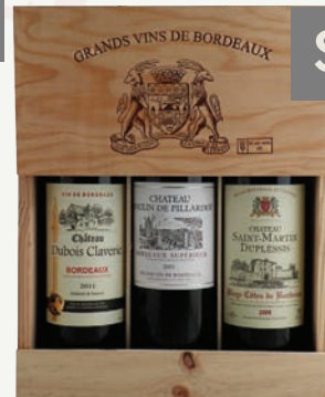
Grand Vin de Bordeaux Bottle Pack