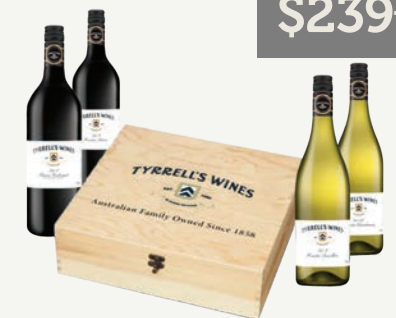
Tyrrell's Vat Range Gift Box