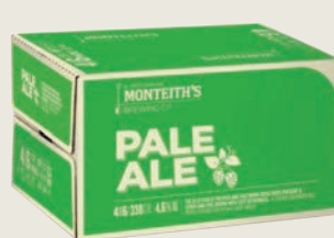
Monteiths Pale Ale