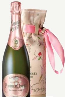
Perrier-Jouët Blason Rose NV

See our website for the complete range - shortysliquor.com.au