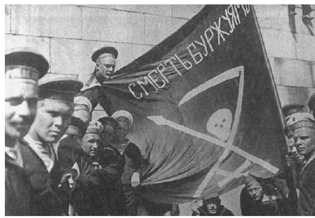
Sailors of the Petropavlovsk in 1917; Flag calls for "death to the bourgeoisie"