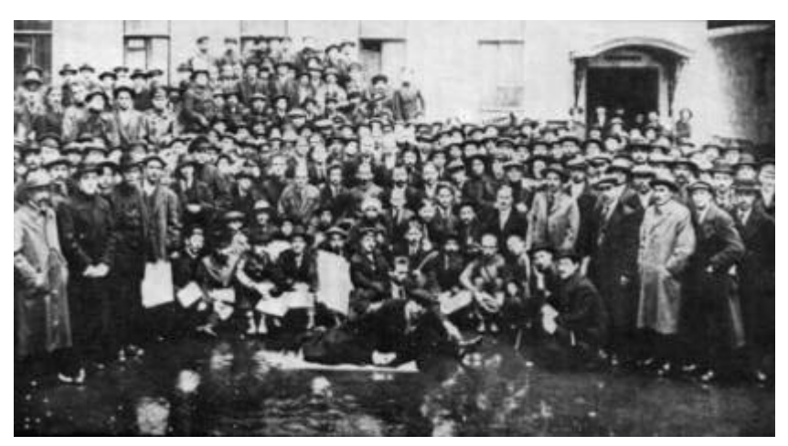
Delegates to the first conference of factory committees during the Russian revolution