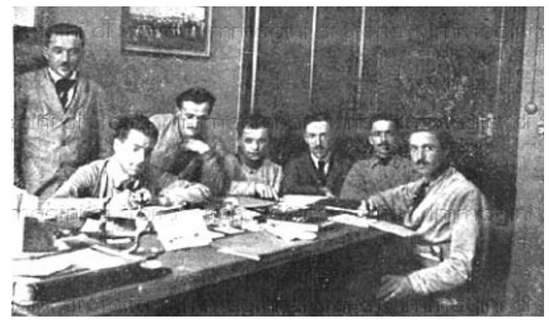
Factory Council meeting at FIAT, September 1920

But the debate on the conduct of the Bolsheviks and the Anarchists on the dictatorship of the proletariat would only later have any sort of notable influence on attempts to revise strategy. In the years from 1920 to 1925, instead, attention was fixed on the re-emergence of State repression and on the spread of fascism which was unleashing armed acts of aggression against the workers' movement, destroying the organisational structures which the masses had devoted untiring energies into building. The more dedicated militants were being assassinated or forced out of their home towns into exile or temporary refuge elsewhere. Already in October 1920, that is to say practically immediately after the abandoning of the factories, the offices