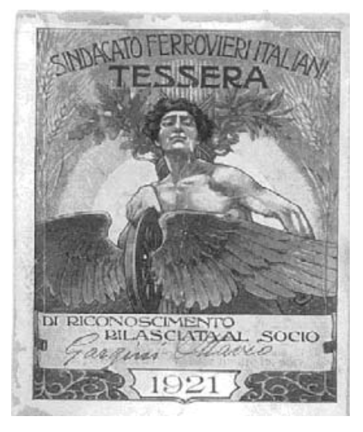
Railworkers' Union Membership Card

In other words, the motion expressed a precise position in favour of labour intervention, while confirming the need to preserve a precise, autonomous role for the anarchist political organisation. As for how Italian anarchists were involved in the labour struggle, there was great variety in the unions to which they belonged. A large number were members of the USI, which in the following two years would reach a membership of 800,000 workers and 27 Labour Clubs. Others were active in unions belonging to the Confederation, with a significant number in the FIOM (the metalworkers union which was federated to the CGdL), even appearing at the confederal conference of 1921 as a single group (41). Others still were members of independent unions such as the Sindacato Ferrovieri (Railworkers' Union) and the Federazione dei Marittimi (Maritime Workers' Federation). But it was above all in the struggles that the anarchist presence grew and strengthened.