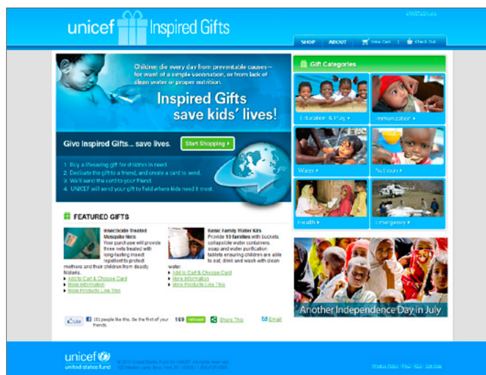
Create a virtual store with a familiar catalog interface.

Increase revenue through discount and promo codes, cross-selling, upselling, and additional donations that can be captured at checkout.