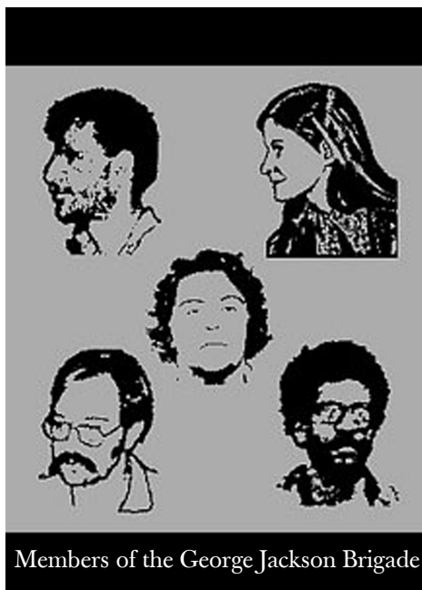
Members of the George Jackson Brigade

When the strike had ended, there had been assurances from the Department of Corrections that the barbaric practices at the prison would stop. Over time, many people saw that the assurances had been empty, with very little changing in the prison. The Brigade bombed the Bellevue bank branches because of the bank's finan-