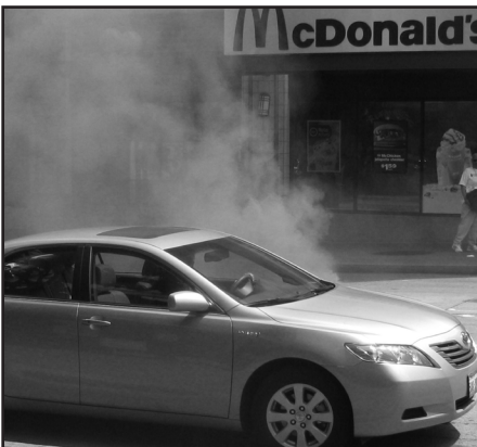
above: Smoke from the smoke bomb right: Banner and leaflets in the air

This action was in solidarity with the Pelican Bay Hunger Strike which, as of the time of this writing, has spread to several other prisons in California. The thousands on hunger strike have been starving themselves for 20 days, some of them losing 25 to 30 pounds and suffering from such ailments as organ failure, loss of consciousness, and severe dehydration.