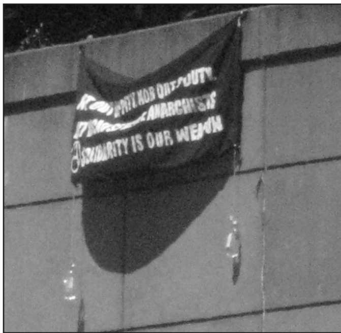
above: Banner hung in view of King County Jail on July 23rd

It is clear that anarchists are dangerous to their enemies even while in jail. While seven were locked up, many more were on the streets outside defying the cops and jailers directly in the face of their power. And even after many of them were arrested, those same anarchists earned the respect of