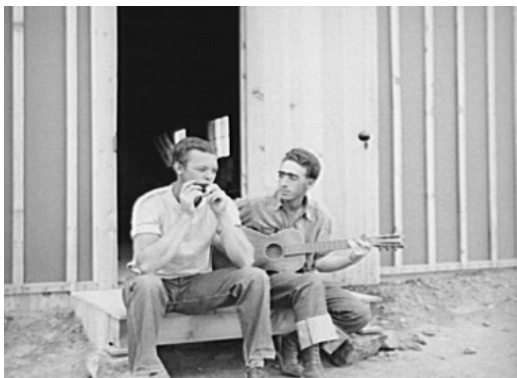
Resettlement Administration workers. Madras, Oregon, 1936.

Williamson, Sonny Boy (John Lee Williamson) Sonny Boy Williamson Vol. 1 Blues Classics 3