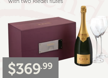
Krug Sharing Set Krug Grande Cuvee NV with two Riedel flutes