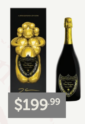
Dom Perignon 2004 by Jeff Koons