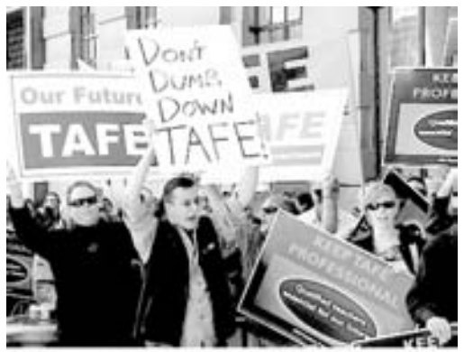
TAPE features at derivate