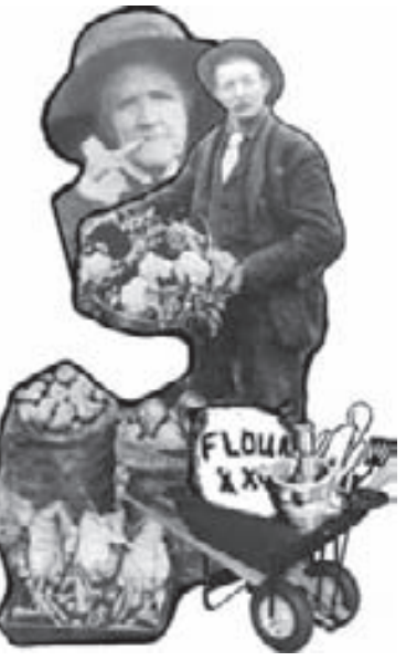
for something better.