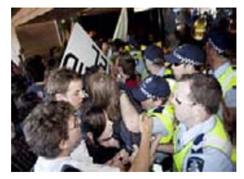
Copenhagen: Updates From COP15

Protesters broke through police lines at the Park Hyatt hotel in Melbourne on 6th December, where Israeli Deputy Prime Minister, Silvan Shalom, was being feted by Julia Gillard as part of the Australia-Israel Leadership Forum. More than 200 protesters blockaded the hotel's main entrance chanting "Free Palestine". A few of the protesters broke through the police lines before being tackled by police in the foyer. Water and dirt were thrown at police, and protesters were sprayed with capsicum spray, before being forced back by police horses. The Israeli Deputy PM has been met with protest throughout his visit to Australia - in protest of Israel's ongoing occupation of the West Bank, and siege on Gaza.