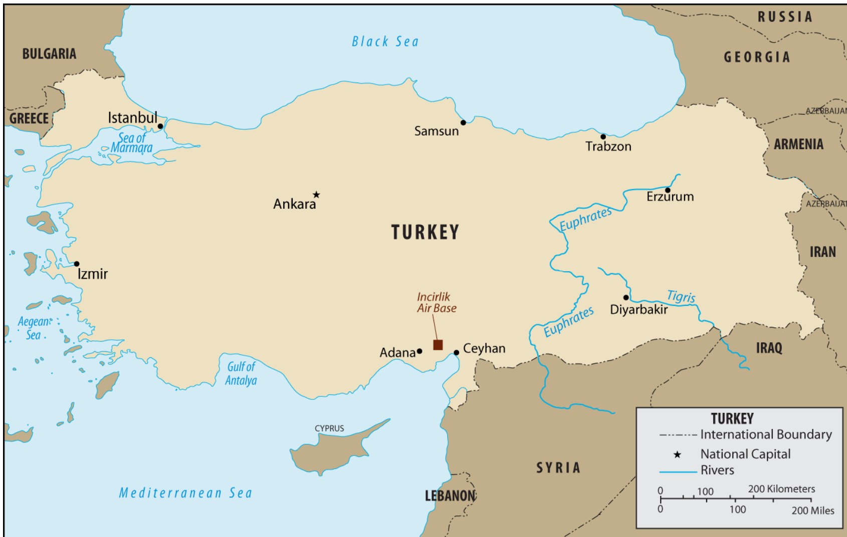
Figure I. Turkey and Its Neighbors