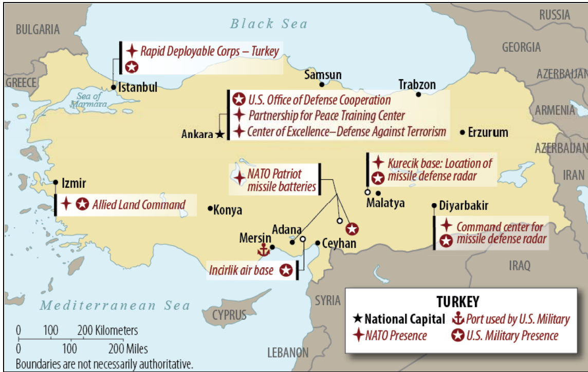
Figure 3. Map of U.S. and NATO Military Presence in Turkey