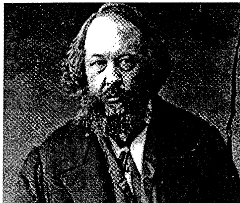
Mikhail Bakunin: anarchist, anti-imperialist

requires active participation in national liberation struggles but political independence from the nationalists. National liberation must be differentiated from nationalism, which is the class program of the bourgeoisie: we are against imperialism, but also, against nationalism.