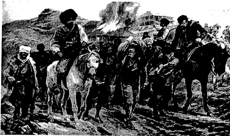
Macedonian partisans during the 1903 nationalist revolt against the Ottoman-Turks

the working class and peasantry against both capitalism and the State. Without social revolutionary goals, national libera-