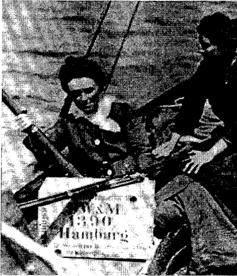
Women volunteers from James Connolly's 'Citizen Army' during 1916 Easter Uprising

sand economic strings... binding them to English capitalism as against every sentimental or historic attachment drawing them toward Irish patriotism," and so, "only the