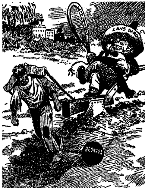
Cartoon depicting exploitation of the Mexican countryside by foreign elites, 1913

In Mexico, anarchists led Indian peasant uprisings such as the revolts of Chavez Lopez in 1869 and Francisco Zalacosta in