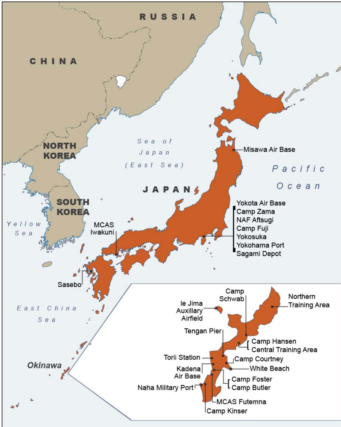
Figure 2. Map of U.S. Military Facilities in Japan