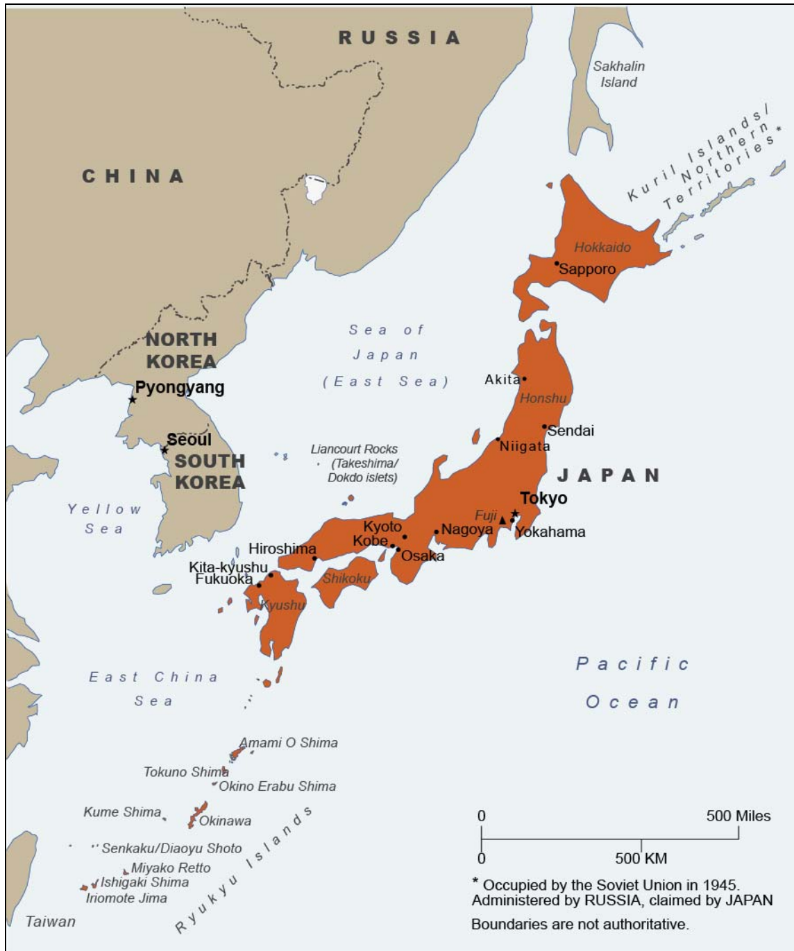
Figure I. Map of Japan