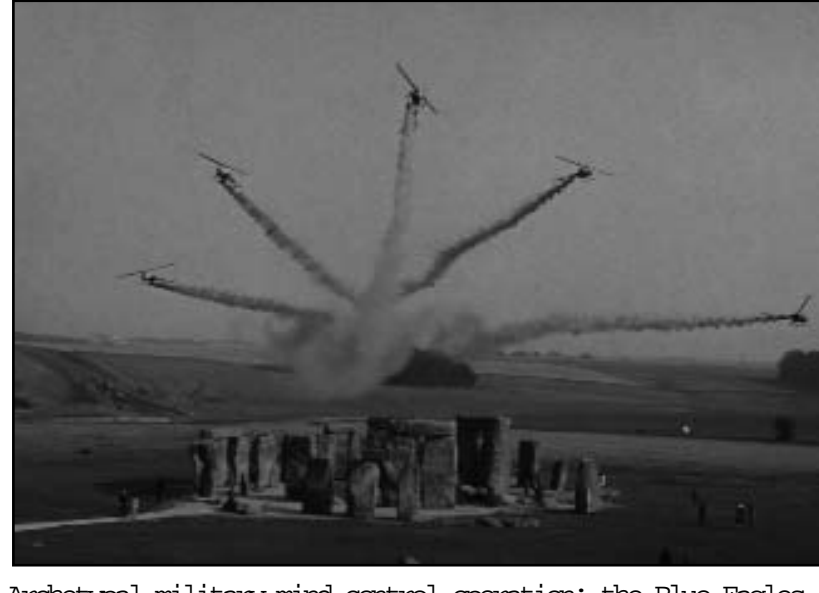
Archetypal military mind control operation: the Blue Eagles an Army Air Corps Display Team active between 1968 and 1976 deployed in the alchemical processing of hippies and assorted new age nutters at Stonehenge in 1972. Previous military actions at Stonehenge include making use of it as a structure on which to perfect flash photography from moving reconnaissance aircraft.

led the LPA and Archaeogeodetic Association to jibe in their jointly authored pamphlet The Great Conjunction: The Symbols of a College, the Death of a King and the Maze on the Hill (Unpopular Books, London 1992, p. 6-7): 'Our techniques are a bit different from those generally used by Ley Hunters. Using computers, we analyse the alignment of points from their latitude and longitude as much as possible, only using grid references at the last stages. We prefer this technique to using grid co-ordinates after the fashion of Lev Hunters. Their techniques seemed to be more centred on cartomancy – not that we reject this entirely. We still see as useful some of the psychogeographical practices of the Situationiste Internationale, such as finding your way about an unfamiliar