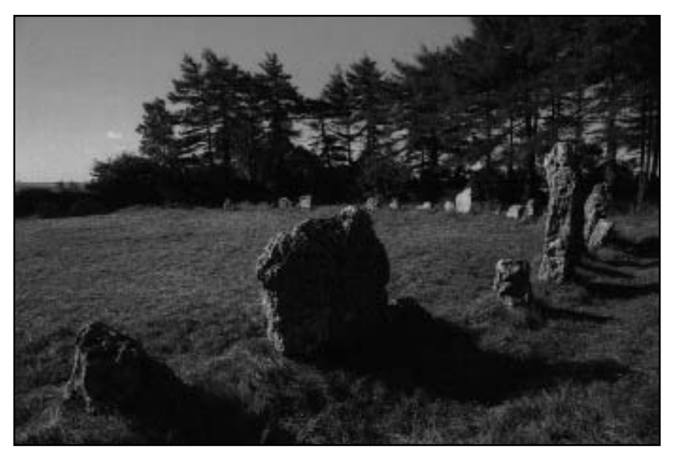
Rollright Stones near Chipping Norton, Oxfordshire.