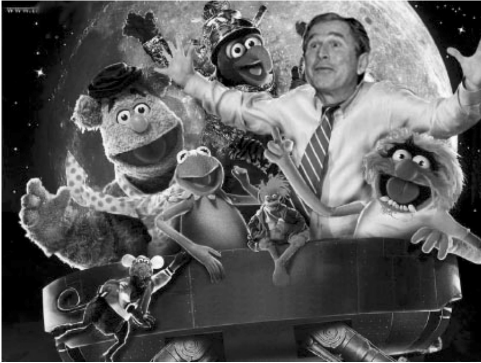
Bush's panel of advisors decide the future of Iraq.

Collectively awarded to Bush's advisors and Bush himself.