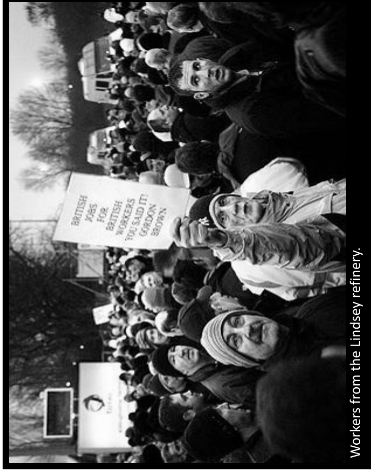
Workers from the Lindsey refinery.

I work for a contracted company in charge of the maintenance of a oil refinery in South Wales. The start of the strike occurred due to an Italian company being contracted to increase refinery capacity at the Lindsey refinery. The strikes quickly spread across the rest of the refineries, sporting the slogan "British Jobs for British workers".