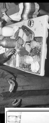
Chicago soup kitchen for striking workers.

economic crisis, just like everyone else? For a start, we have to go on the offensive. Wage-cuts, unemployment and poorer conditions of work must be fought. Taking militant industrial action is a good strategy for the public sector. It means demanding what we are owed and refusing to work for less. This is less effective if privately owned workplaces go bust. One way of surviving is to make worker-controlled cooperatives out of failing enterprises, but this still assumes a line of credit and consumers with cash, and the boss would have to go!