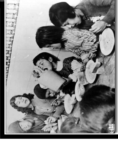
Community kitchen during the Spanish Civil War

This crisis could never happen in an Anarchist society. But how do anarchists respond as people affected by