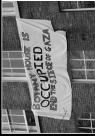
Banners displayed at Leeds University occupation.

In response to the killing of innocent Palestinians and continuing siege on Gaza, students across the country have been occupying university buildings demanding aid to the people of Gaza and deinvestment in companies that support the Israeli state. The actions started when students from the London School of Oriental and African Studies (SOAS) occupied and closed an exhibition held by the Ministry of Defence. The exhibition celebrated the role of the British armed forces in defence of the British Empire. The occupied