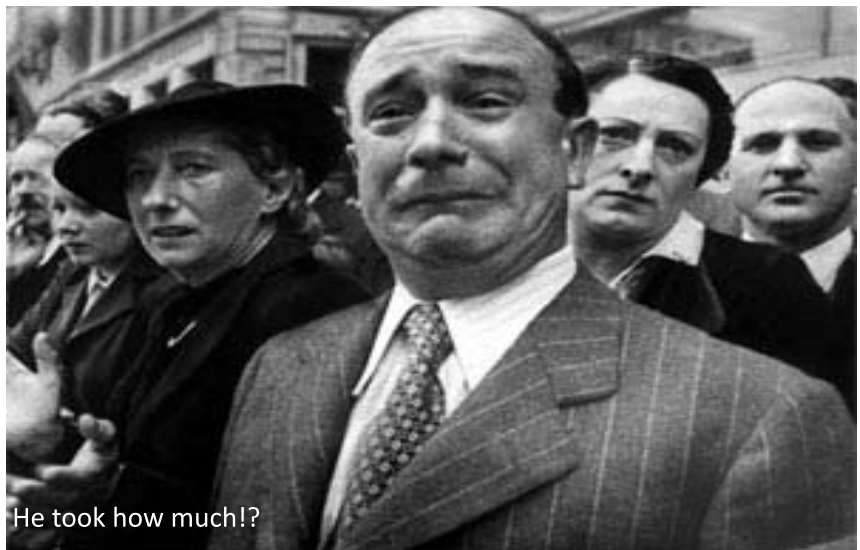
He took how much!?

He scores double points for hitting Spanish banks, whose current pre-eminence in Europe is the result of