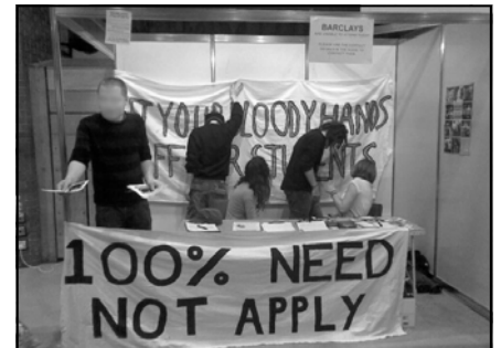
"Barclays are unable to attend today"