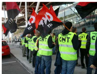
Photo: Anarcho-syndicalist trade union demonstration. Rank-and-file resistance, without leaders or bureaucrats.

Where officials deny action, mass meetings should force it. When bureaucrats cut off strike funds, local whip-rounds and benefit events should replenish them. And if full-timers concede to management or government to bring an action to an end, the rank-and-file should ignore them.