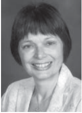
President of the Senate - Designate Sandra L. Pappas