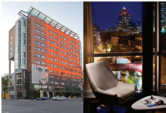
Hotel ZERO1, chic, urban, in the heart of Montreal’s Quartier des Spectacles. zero1-mtl.com

Games, but then it fell into a 1980s slump as old industries closed or moved away, although the port on the St. Lawrence Seaway remains Canada’s second busiest. Resurgence came in the 1990s, and today high-tech industry abounds.