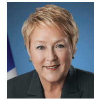
Pauline Marois Premier

Some 90 percent of Quebecers live within 100 kilometers (some 60 miles) of the U.S. border, and areas of Quebec's economy are already highly integrated with their counterparts in neighboring U.S. states. "Many parts and systems are produced on both sides of the border to make the final product," Marois says. ■