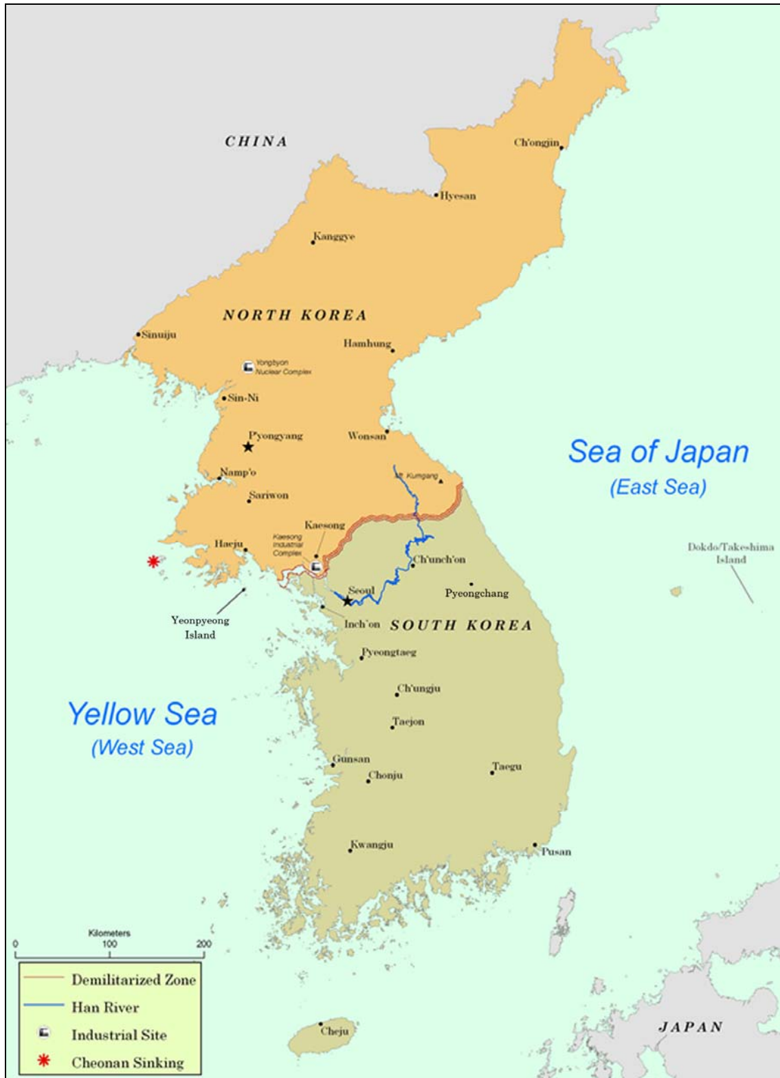
Figure I. Map of the Korean Peninsula