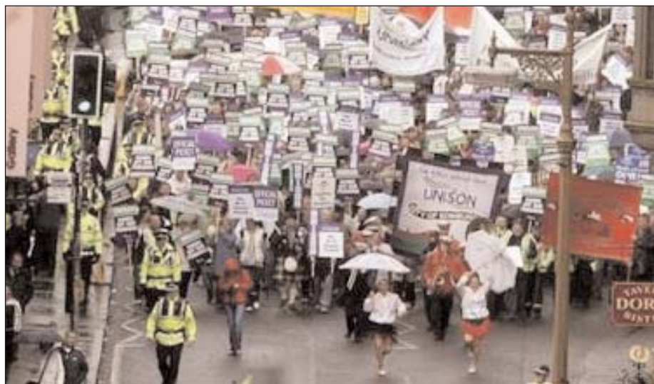
Demonstration in Edinburgh. The strike against pension reforms shut down schools, council offices and other public services across Britain with widespread support.

The attack on pensions which is taking place in the private and public sector is an audacious effort by business to pass the costs of market and government failings onto workers in order to maintain and maximise existing profits. The Government hopes to