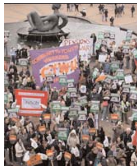
Birmingham strikers' demonstration.

We look forward to workers here in the UK and across the world resisting these sets of degrading reforms with every tactic in our artillery, withdrawing our labour, taking to the streets and bringing the country to a standstill by whatever means necessary to defend and strengthen our position and to take the fight to the employers.