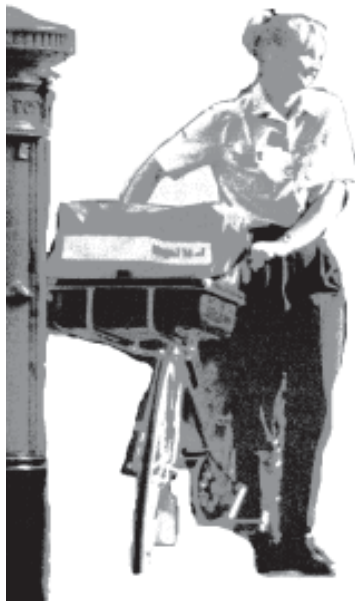
Post Office: people for sale

Apparently "This is an important opportunity for us all - and one which we must grasp". Two million quid would have presented many smaller delivery offices with an opportunity to upgrade catering facilities beyond sweet machines and enable hot food to be offered to staff. It might have been used to provide waterproof coats which actually keep the rain out. It could have given everyone a few extra pounds in our wage packets, or it could have gone towards the long promised five day week for those