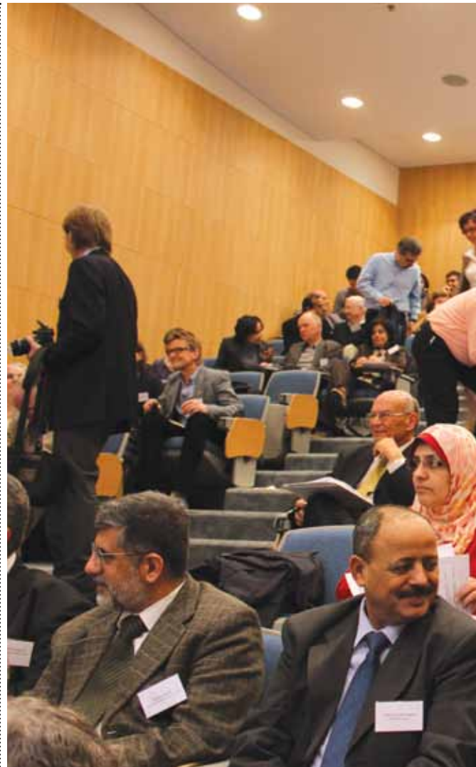
Two-day conference on the health of Palestinians inside and outside

Richard Horton's opening address to the conference stressed the role of research not only as a way of obtaining clear answers to clear questions, but also as the basis for values-based advocacy, pursuing issues of justice and fairness. "Why are we holding these annual gatherings?" Horton asked, "Because the paralysis of the