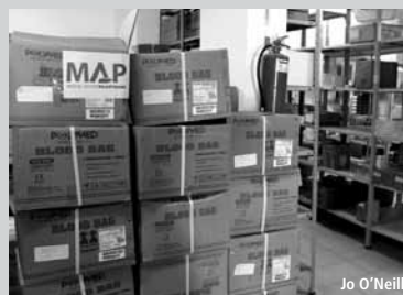
MAP supplies, April 2012

In March we contacted some of our donors about the fuel crisis in Gaza. The massive restrictions on the amount of fuel getting in because of the blockade, together with further disruptions to the supply of fuel from Egypt, were having a catastrophic impact. With power cuts lasting up to 18 hours a day, hospitals and medical clinics were at breaking point – being forced to cancel operations and medical procedures as the power ran out.