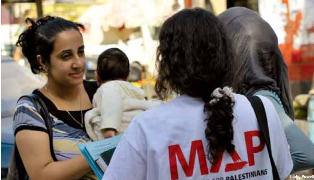
Maternal and Child Health project