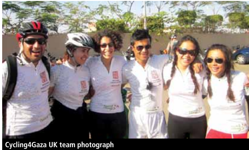
Cycling4Gaza UK team photograph

Cycling4Gaza was founded by four friends to raise awareness and funds for reliable and reputable charities to improve healthcare and education for the Palestinian community.