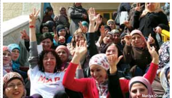
Community Health Workers accreditation

With MAP's support 227 Community Health Workers sat at the Ministry of Health to take the first professional accreditation examination in Palestine of Community Health Workers as a recognised cadre. There were so many Community Health Workers that the examination had to be taken in two shifts. The sheer joy and enthusiasm for this opportunity was buzzing in the room, as one Community Health Worker enthused: "Regardless of the outcome of the exam today, whether I pass or fail, we have finally made our mark. This is a point in history for us"