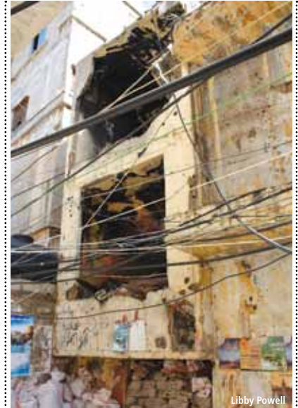
Bourj el Bourajneh