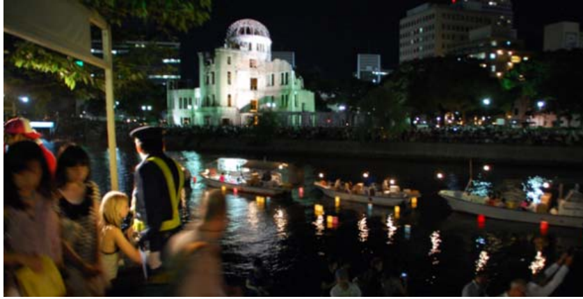
23 February 2011 (All day) Action Alert

The Non-Proliferation Treaty Review Conference in May last year declared its goal “to achieve the peace and security of a world without nuclear weapons”, and called on all states to make “special efforts” to establish a framework for it, focusing on the proposal of UN Secretary-General Ban Ki-moon for the start of negotiations on a convention banning nuclear weapons.