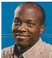
VERNON BRYANT Staff photographer

FUTURE JOBS The News generally requires a minimum of three years' experience for most newsroom positions. However, interns who have completed their degree are welcome to apply for permanent positions upon completion of their internships. Below are pictures of a few of our former interns who are now full-time staff members.