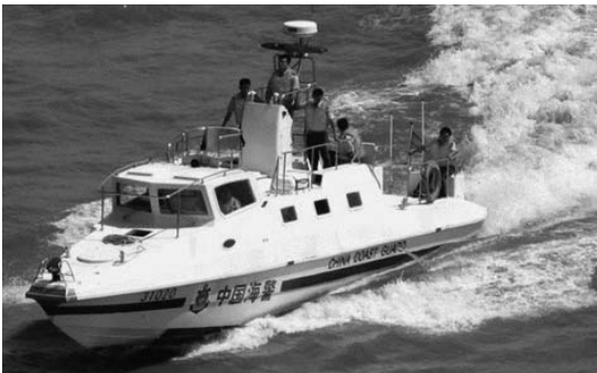
Photo 3. A small patrol boat in service with the China Coast Guard. Chinese civil maritime authorities have lacked for an adequate motor surfboat for rescue operations and have apparently considered purchases from abroad to fill this requirement.

advanced software to create a high degree of fidelity comparable to simulators in use in the West.