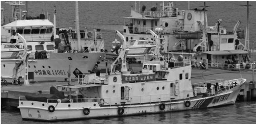
Photo 18. Two small cutters from the MSA (foreground and right), are shown berthed across from a cutter from the FLEC. There is some coordination among Chinese civil maritime authorities, but it is also clear that Chinese maritime analysts perceive some problems in getting the disparate agencies involved to work in concert to serve China’s maritime interests.

A final explanation has been a recurrent theme of this paper and is the central theme of the important Ningbo Academy study of 2007—that the balkanization of maritime enforcement entities in China has severely inhibited the coherent development of Chinese coast guard entities. 127 The dragons duplicate one another in certain functions, fail to