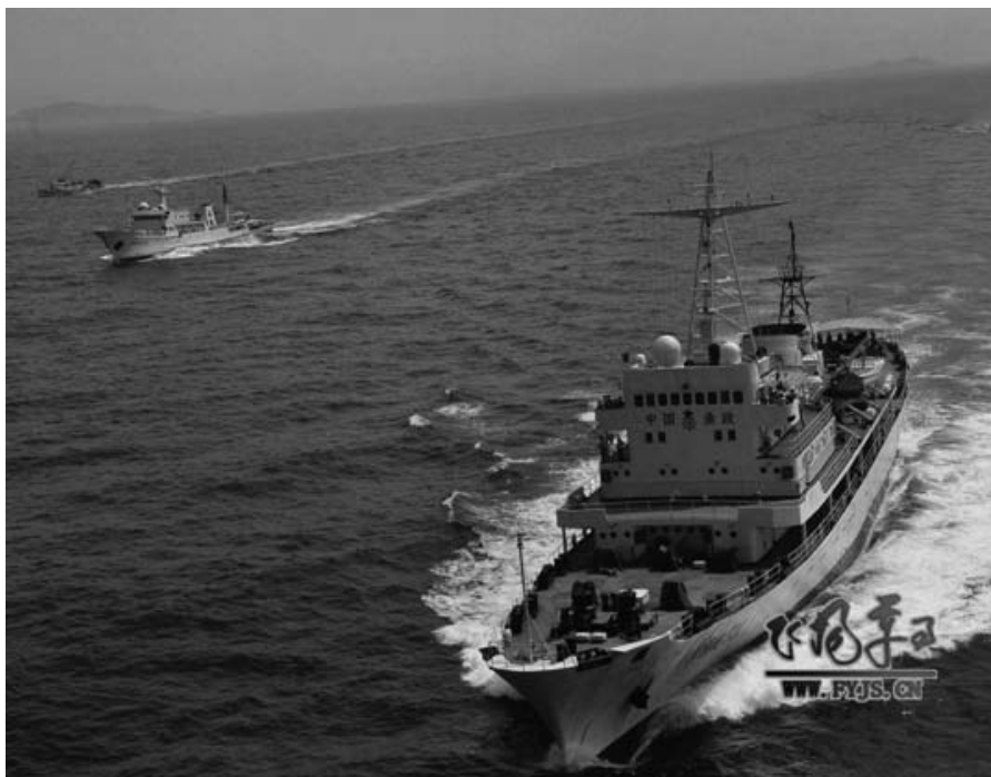
Photo 25. Fisheries Law Enforcement Command vessel 311 exercises with other FLEC vessels. FLEC 311 is China's largest fisheries management vessel and was dispatched to patrol the South China Sea when tensions arose in the area during mid-2009. It is expected that the FLEC will receive additional large cutters in the near future. FLEC 311 served formerly with the PLA Navy.

A third strategic implication may be even more important—that coast guards represent a distinctively different form of power than do navies. As explained by the authors of the Ningbo Academy study, “Naturally, in the course of the struggle for national interests, contradictions are inevitable. The real question is what means are used to settle these disputes. Giving full play to the government’s capabilities, deploying the navy cautiously and strenuously trying to limit the conflict’s scope to among the civil maritime authorities, can avoid a resort to escalation of the crisis.”