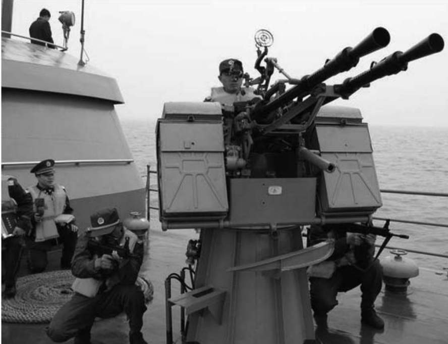
Photo 4. Ministry of Public Security forces on a China Coast Guard cutter participate in a drill. Most of China's other civil maritime agencies are unarmed. This has caused some consternation, for example, when Fisheries Law Enforcement Command vessels are lacking deterrence or enforcement capabilities.