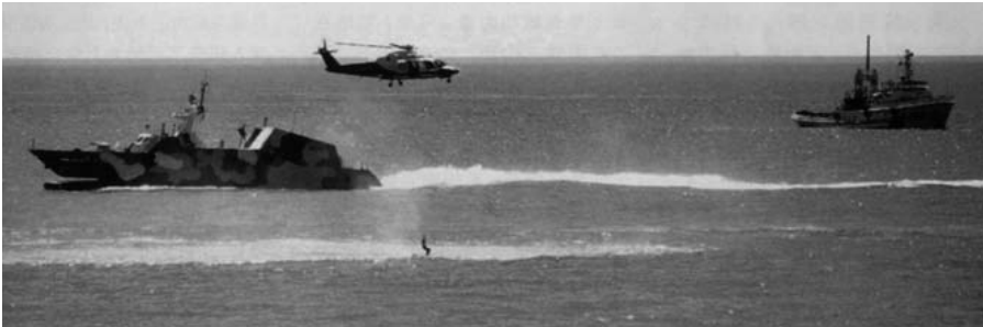
Photo 16. In July 2009, the first-ever major search and rescue exercise involving significant naval units and civil maritime entities (twenty-five vessels and thirteen agencies) reportedly took place in the Pearl River Delta of southern China.

publication describing the exercise notes that China has set up a new and robust search and rescue system but laments that the military regions are not well integrated into that structure—a problem suggesting the need for further such exercises. 118