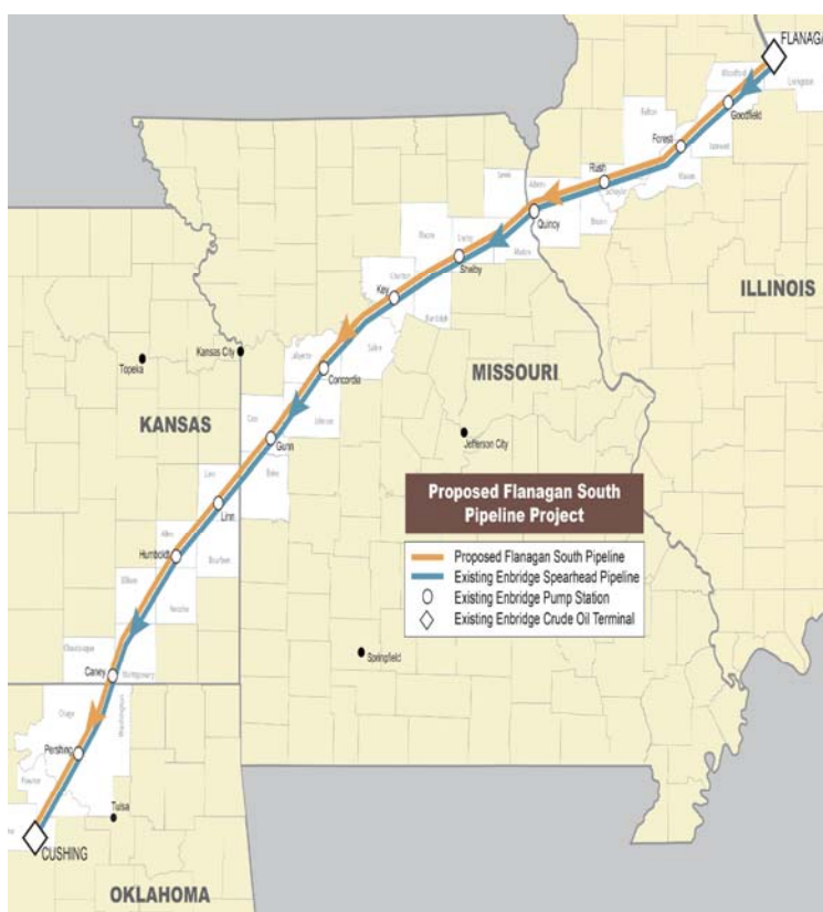
Figure 4. Proposed Enbridge Flanagan South Pipeline Route