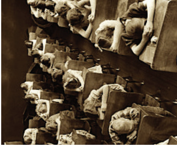
Edu-Factory: a capital education Today, education and knowledge are key resources and raw materials for the capitalist economy. This is expressed through the logic of 'modernising the university', which

The crisis for Australian capitalism is how in this historic window of opportunity can it make people work enough, and hard enough, and long enough, to accumulate as much value as possible. The answer that the budget makes is that despite the low unemployment there is also a large lack of participation in labour market – that is people that the government thinks are not effectively looking for work. So the answer for the state is to work out a way to squeeze these people into the workforce. Arguably the most important part of the budget is Building Australia's Future