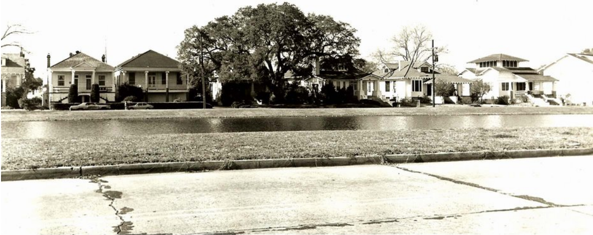
PHOTOGRAPH NO. 17: View of the continuation of the 1400th block of Moss to North Carrollton Ave. and City Park Ave. The building partially visible at left is the de Lapouyade residence, the home of that family for four generations. The structure faintly discernible at far right is the first residence facing Bayou St. John. The building not shown in the picture which corners to Moss and No. Carrollton is an apartment building facing No. Carrollton. Of interest in this picture is the beautiful oak tree. This is the historic "Trading Oak" under which trading with the Indians and settlers took place in the early days, probably even before the settlement of the Vieux Carre'. It is between 300 and 400 years old.