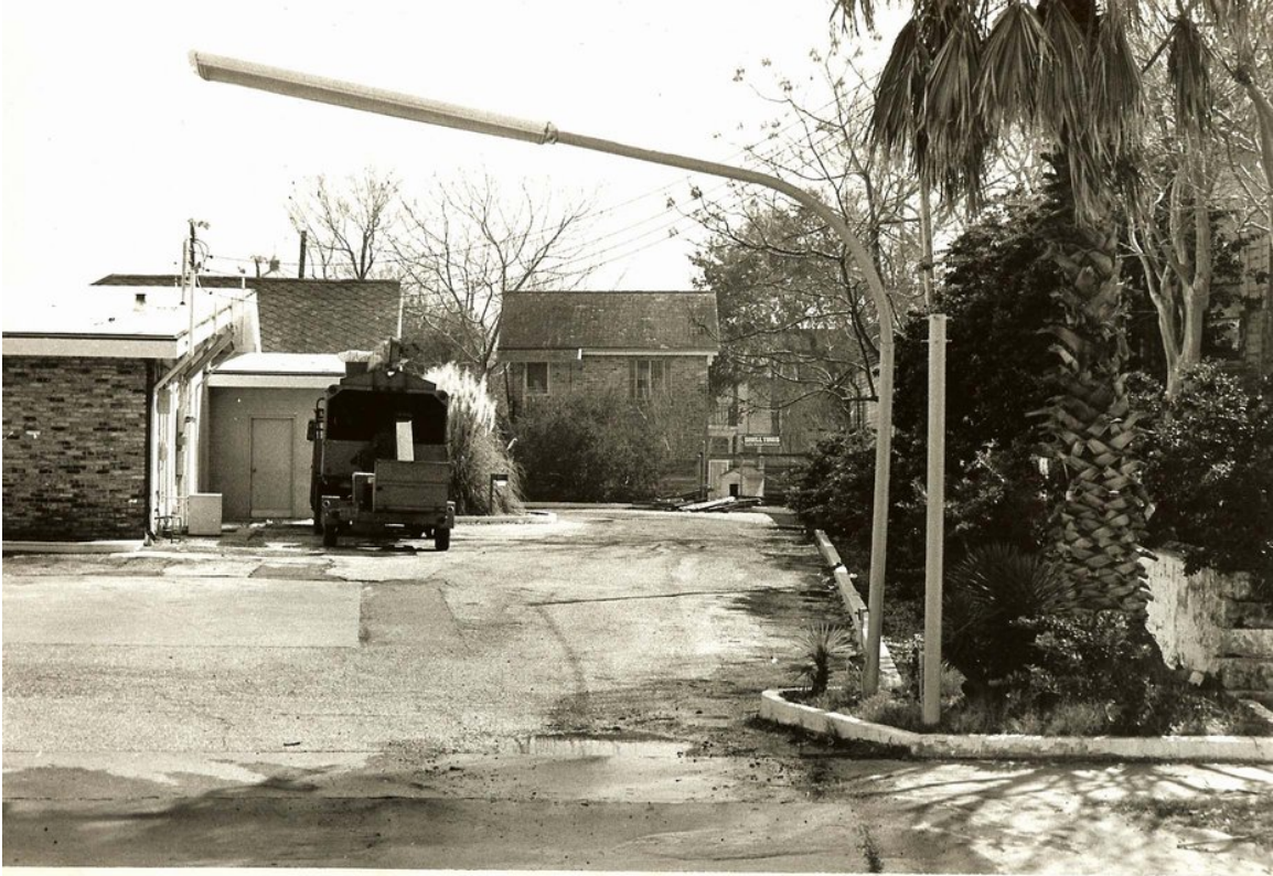
PHOTOGRAPH #22 : Close-up view of rear of service station which gives a clearer picture of the width of the buffer zone and the wide flower bed which screens the service station from the 1492 Moss Street property. The structure at the rear is a side view of the garage and guest house in the lot and garden behind 1454 Moss Street. The 1454 Moss Street residence faces Bayou St. John around the curve which begins approximately at the 1492 Moss Street property (the proposed restaurant).