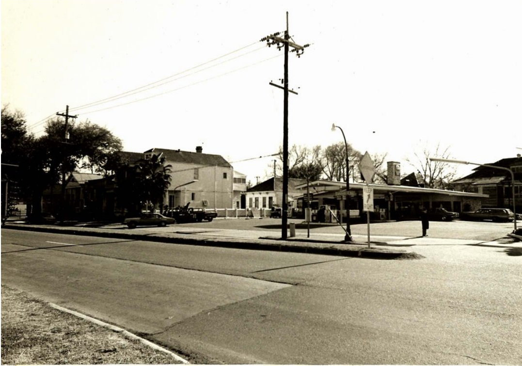
PHOTOGRAPH #20: View of the service station from Esplanade Avenue. At far left is the Desmare Playground. From the playground to the service station all structures are residences. It will be observed that the side of the station facing Moss Street is well back from the Bayou.