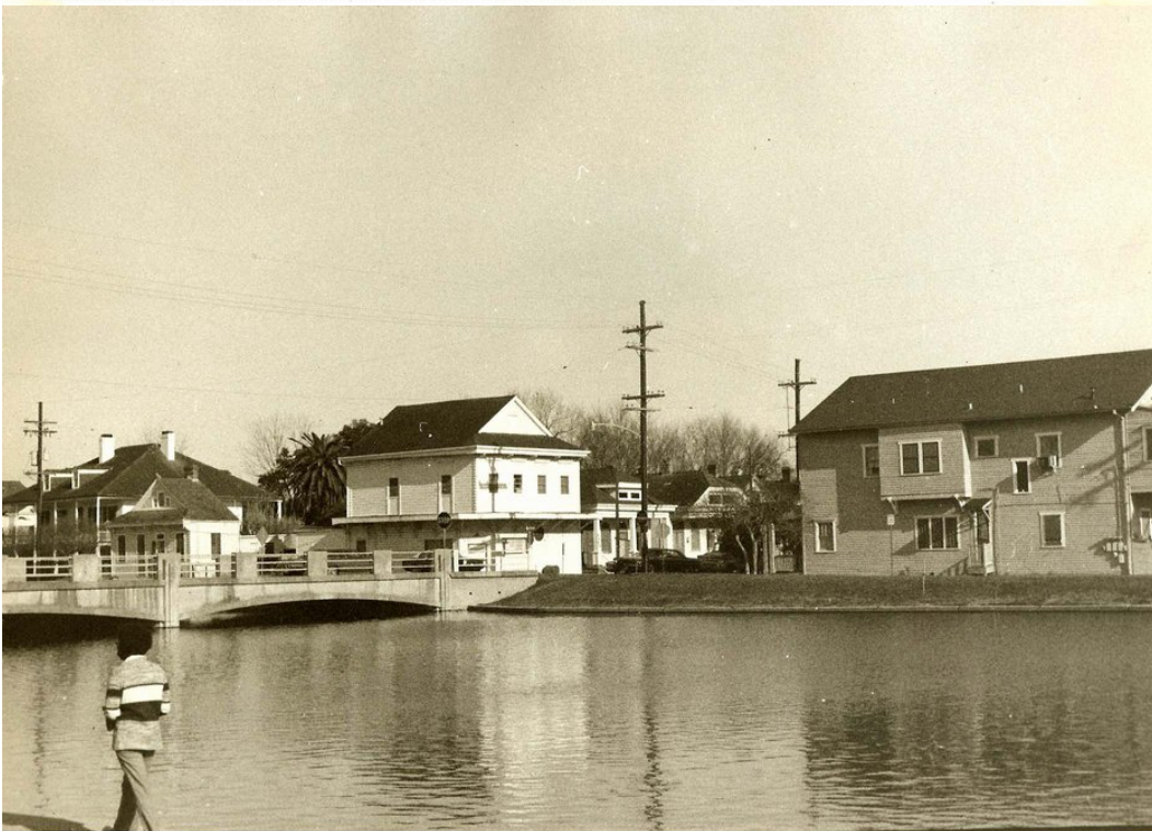
PHOTOGRAPH #9: Another view of converted store and bar-room with residence opposite. Both properties face Dumaine with side to Bayou. Dumaine bridge at left of picture furnishes one of the entrances to Moss Street by which 1492 Moss Street may be reached.