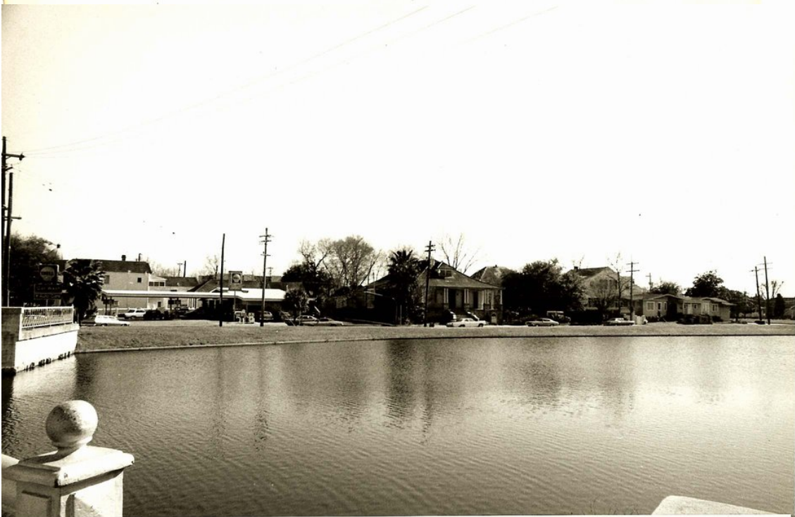
PHOTOGRAPH #19: View from the Esplanade bridge of northeast side of Bayou, the 1492 property being indicated by the arrow. At the left is the service station which faces Esplanade Avenue and has been in this location since prior to 1929, the date of the first ordinance. Between the rear of the service station and the brick wall bounding the 1492 property, there is a distance of 46 feet, a wide flower bed having been planted on the service station side of this wall after this rear lot was classified transitionally a number of years ago as a buffer zone between the service station and 1492 Moss Street.