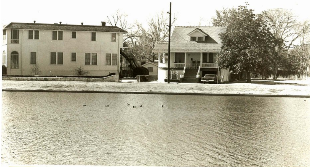
PHOTOGRAPH NO. 14: Continuing around the curve of the Bayou, this picture shows at the left the two-story apartment dwelling facing Bayou right at the curve, the next residence being an older structure, probably built about the turn of the century. A point of special interest in this photograph would be the wild ducks swimming in the Bayou. The picture was taken in the early morning when wild ducks - and sometimes herons - are seen in the Bayou. The quiet tranquillity of the Bayou that attracts the water fowl is one of the many reasons why residents of the area are so partial to, and defensive of, the quality of life in their neighborhood.