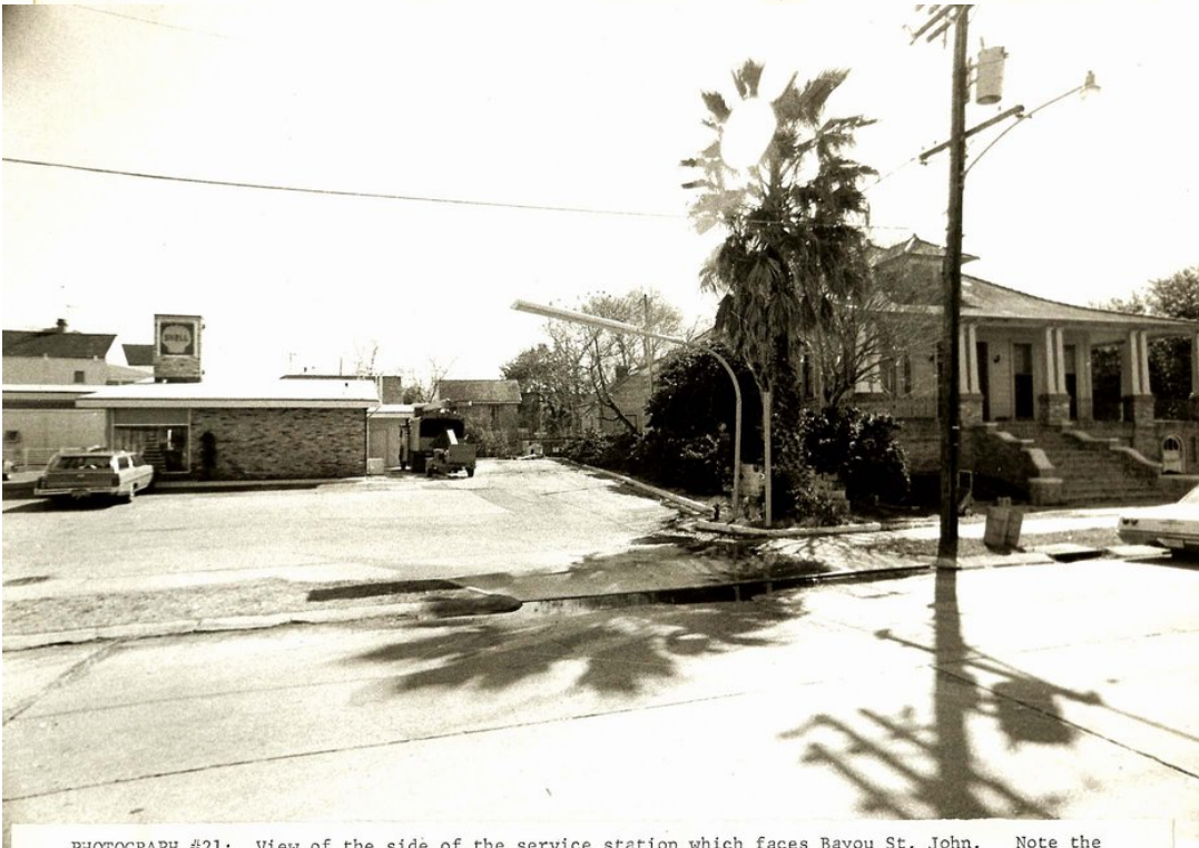
PHOTOGRAPH #21: View of the side of the service station which faces Bayou St. John. Note the extremely deep space from the curb to the side of the station, the station itself not being visible on Moss Street until one passes the 1492 Moss Street property. This picture shows a view of the 46 foot area in the rear of station which is used only as a driveway and acts as a buffer zone between the service station and 1492 Moss Street. At the far rear the arrow indicates the garage and guest house behind the 1454 Moss property facing the Bayou.