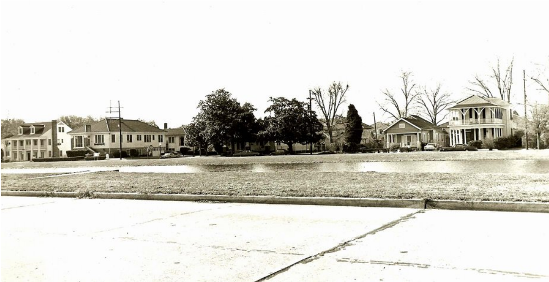
PHOTOGRAPH NO. 16: View from Harding Drive along the Bayou, the first two buildings, both duplex apartments, do not appear in the picture. The third structure, a Southern plantation-type residence, is at far left, the next residence cornering to Wilson Drive and Moss. The residence on the opposite corner of Wilson and Moss is partially hidden by two large magnolia trees. Of interest is the fact that these trees are remnants of the old MAGNOLIA GARDENS which was operated in long past years as an amusement park. From Wilson Drive toward No. Carrollton is the 1400th block of Moss. All buildings are residences. The one at right in picture is the Mullen residence, the home of the Mullen family for four generations. This house was built during the 19th century, when the Mullen family operated a shipyard on the Bayou.