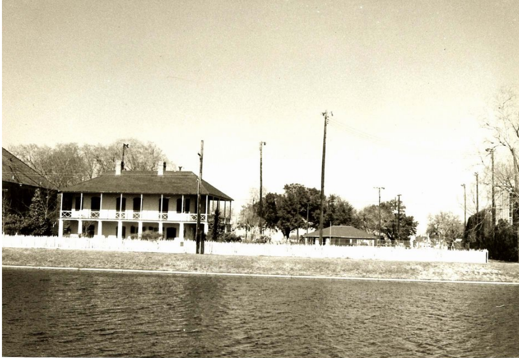
..... PHOTOGRAPH #4: Close-up of Pitot House (Museum) and Desmare Playground. Pitot House was home of first elected mayor of New Orleans. It was restored by Louisiana Landmarks Society and is occupied by Curator of Museum and his family. Bronze Historic marker on premises does not show in picture, but is on the Bayou bank opposite the house.