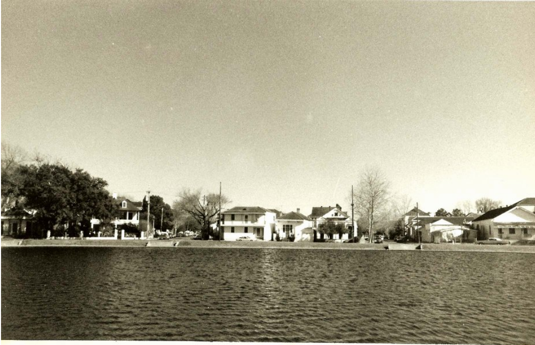
PHOTOGRAPH #6: View begins at left with Old Spanish Custom House corner Grande Route St. John and Moss, one of the boundaries of Square 438/492. There is a bronze historic marker with appropriate legend on this property which is not discernible in photo. Grande Route St. John follows the course of Bayou Gentilly which joined Bayou St. John at this point. The 2-story building at corner of Grande Route St. John and Moss opposite the Old Spanish Custom House is now a residence. On this corner there was originally a 1-story building occupied by Hoffman's Grocery and formerly called Belmont's Grocery. Present residential structure replaces the grocery. Residences continue along Bayou to right just past De Soto Street. At right corner of De Soto and Moss the structure facing De Soto was in the past a service station which is now converted to residential use.