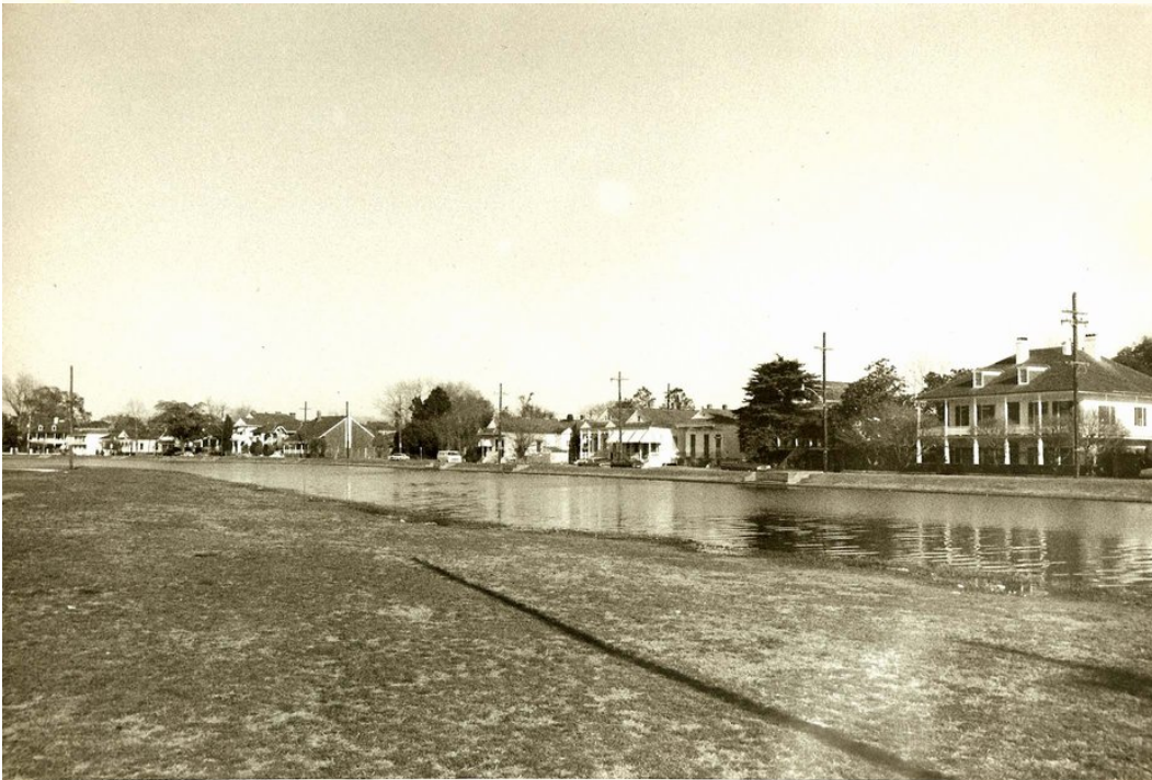
PHOTOGRAPH #7: View from Holy Rosary rectorry to The Sanctuary, West Indian style plantation home (far right). This is another Historic Landmark and will shortly be identified with a Bronze Marker. Barely discernible behind the trees at left of the Sanctuary is another very old residence, well preserved and of historic value. All other structures in the picture are residences of varying ages, most of which were constructed in the 19th Century. Arrow indicates Bell Street. In the past there was a commercial structure on right corner of Bell and Moss which has now been demolished, the site now being used as garden for 3344 Bell St. residence.