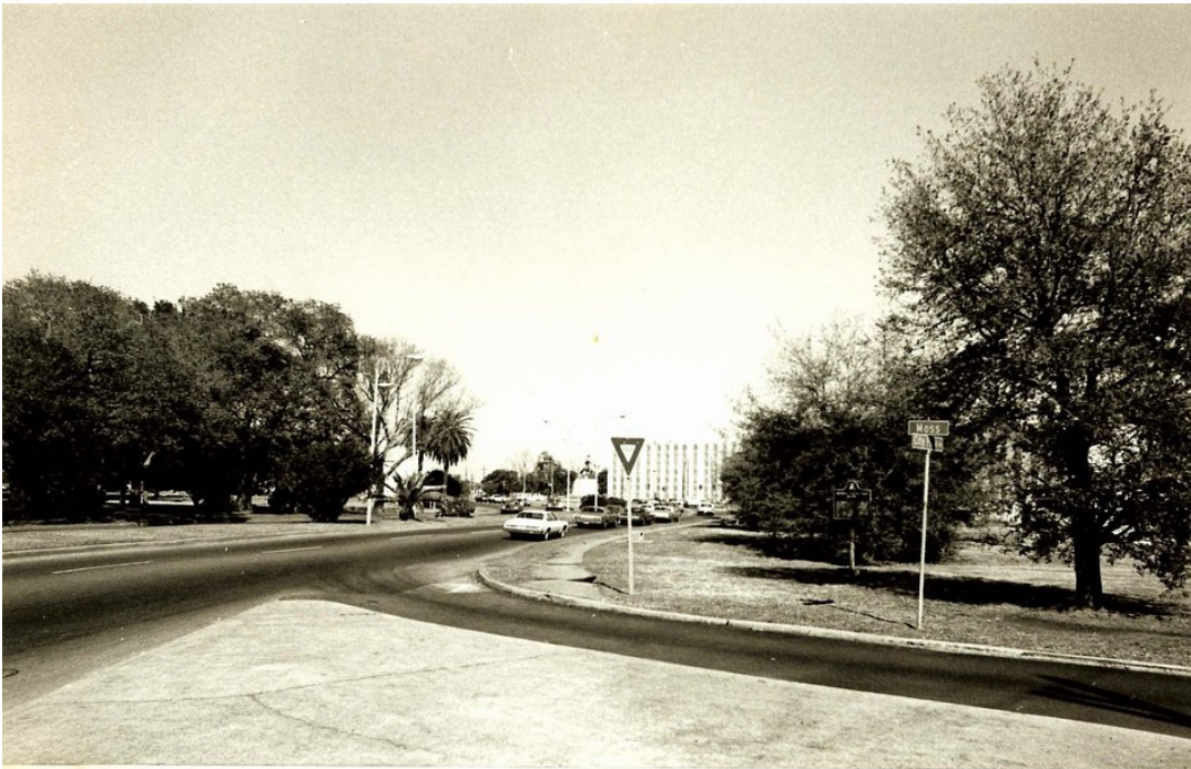
PHOTOGRAPH #1: Corner of Moss Street and No. Carrollton Avenue on City Park side of Bayou St. John looking toward Beaugard Circle at Esplanade Avenue entrance to City Park. Tall structure in center background is Park Esplanade Apartment building on opposite side of Bayou. Arrow in foreground points to historic marker shown in Photograph #2.