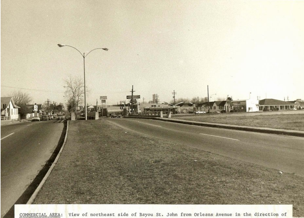
COMMERCIAL AREA: View of northeast side of Bayou St. John from Orleans Avenue in the direction of Lafitte Street. This area, consisting of two short blocks, comprises the only commercial establishments on Bayou St. John except the filling station at the corner of Esplanade Avenue and Moss Street facing Esplanade Avenue, the side of which only is visible from Moss Street. From Orleans Avenue to Lafitte St. on the southwest side of the Bayou, the area is likewise commercial. The American Can Co. has been in this location since the turn of the century. At present in the same block there is a hardware store facing Orleans Avenue and an office building facing Bayou St. John.