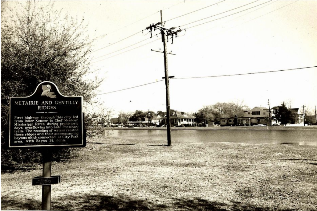
PHOTOGRAPH #2: Close-up of Historic Marker on City Park side of Bayou St. John commemorating Metairie and Gentilly Ridges formed by Bayou Metairie and Gentilly. Bayou Metairie joined Bayou St. John at this point opposite 1460 Moss which is next door to 1492 Moss property (proposed restaurant site). These residences appear in background of picture & face Bayou St. John between Esplanade and curve of Bayou in Square 438/492. Bayou Gentilly connected with Bayou St. John at Grande Route St. John which bounds Square 438/492 at far end of square. Boundaries of said square are Esplanade, Bayou St. John (Moss Street), Grande Route St. John and Mystery Street. This is the most important square in the historic Bayou St. John area.