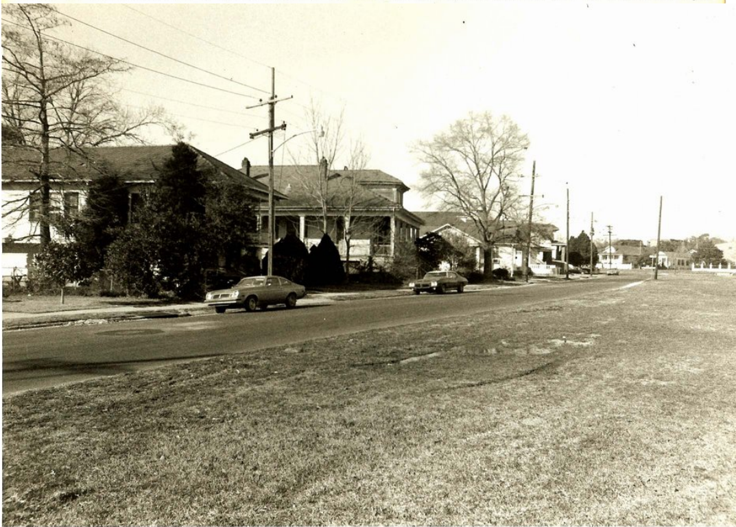
PHOTOGRAPH #13: Continuing view on Moss Street in the direction of City Park along Bayou St. John. Rounding the curve shown in Photograph #12, the Blanc-Denegre plantation home (now church rectory) is discernible at the right, located on opposite side of the Bayou.