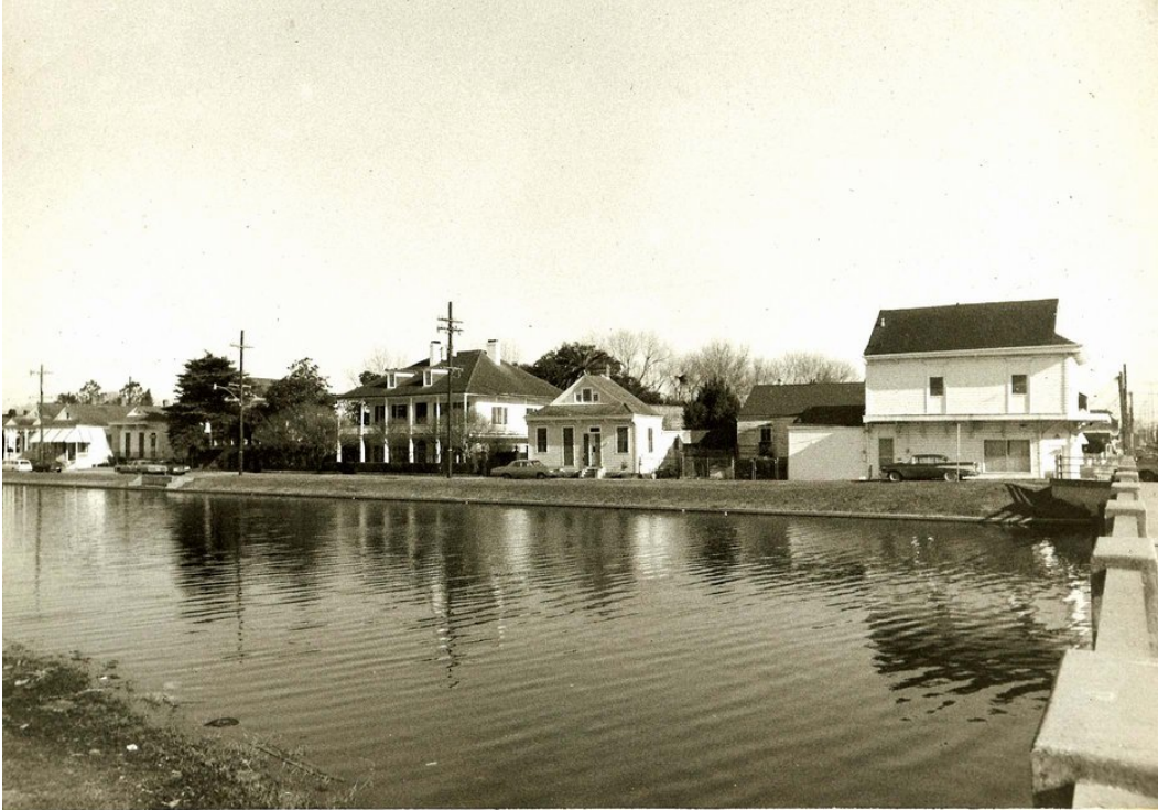
PHOTOGRAPH #8: View beginning at St. Philip St. and extending to Dumsaine Street, the Dumaine bridge appearing at far right. The Sanctuary also appears in this photo. At right is side view of building cornering to Moss and Dumaine. A grocery store and bar room were operated in this building for approximately 40 years. Building is now used as a residence on the second floor and as a meeting room on the first floor for the Veterans Association which owns or leases the building.