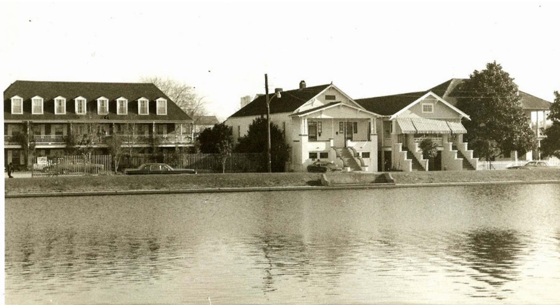
PHOTOGRAPH #10: View of Moss Street between Dumaine and St. Ann. Apartment house at left was built in recent years. The plantation-style architecture is compatible with the Bayou area and was approved by the majority of Bayou St. John area residents when the architectural plans were submitted to the City. The other structures are residences, the building partially visible behind the trees at far right being on the corner of Moss and St. Ann. It is a duplicate of the Pitot House and more fully referred to on Photograph #11.