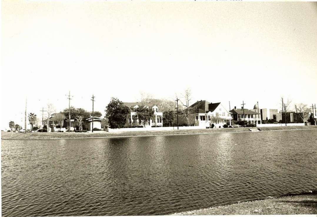
PHOTOGRAPH #3: View of Square 438/492 facing Bayou St. John, beginning at Esplanade Avenue (end of square) and continuing to Cabrini High School. Structure barely visible at left is Park Esplanade Apartment building facing Bayou St. John across Esplanade Avenue (opposite Square 438/492). Filling station is not visible. Palm tree and shrubbery at left of 1492 Moss are in flower bed along brick wall on service station property. Brick wall is 46 ft. from building line of service station.