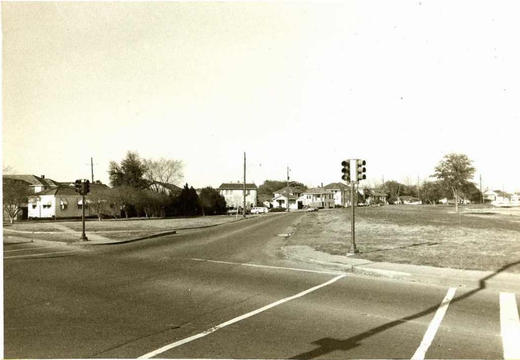
PHOTOGRAPH #12: Intersection of Orleans Avenue and Moss Street on the southwest side of Bayou at the Orleans Avenue bridge crossing. All structures in this photograph are occupied as residences. The arrow indicates a very old 18th or 19th century plantation home on the Fairview Plantation. This building is just off Dumaine Street facing Bayou St. John. This view continues to a sharp curve in the bayou, across the bayou from which to the far right is the Blanc-Denegre plantation home (now the church rectory).