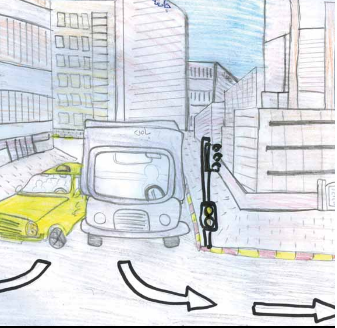
vith disability. The car expresses her independence as it was the first time she travelled to Ramallah independently.