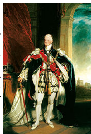
I'm not over dressed For this little do, am I?

Well you have to admit, when it comes to spending money in a big way the Jubilee takes the biscuit. What a lavish pouring out of public money to titillate the egos of our lords and masters. No expense spared, heads of state from across the world, banquets, and luncheons fit for a queen, probably as many troops playing at pomp and circumstance, parading up and down central London as we have in Afghanistan. However at the other end, there's money to be made. It seems that a stewarding company called Close Protection UK had a contract to help steward this lavish event, but when it comes to the wages of the stewards, well it wasn't quite no expense spared. For the event this company took on 80 unemployed, under the governments apprentice scheme, 50 were under 25 and paid £2:60 an hour, the other 30 either accepted the same rate or refused payment as it would adversely affect their benefit money. Now that's a good deal if your a business. It was a 14 hour shift with no access to toilets during their shift, they were brought in by bus from Plymouth, Bath and Bristol, dumped in the middle of the night in London with no shelter. Compare this