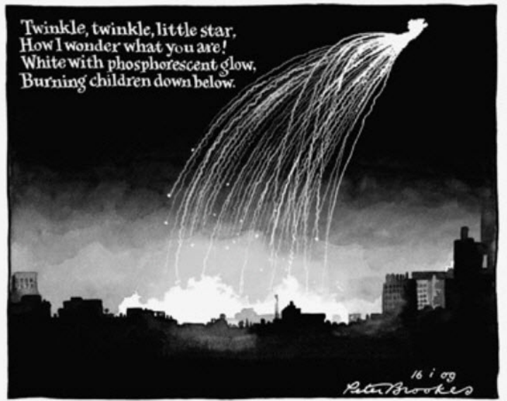
Drawing by Peter Brookes of The Times.

BP has just agreed the details of its contract to develop a vast oil field in the Basra area and other companies are lining up to gobble up the rest of Iraqi oil. A blood curling slaughter of innocents to open up the Iraqi oil fields to the big corporate world, as they make sideway glances in the direction of Iran.