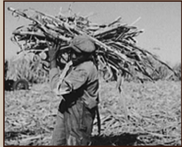
Cut sugarcane being carried to the trucks for the USSC (United States Sugar Corporation). Clewiston, Florida, 1939.

Unsurprisingly, forced labor took root in this climate, as well. In 1942, for example, the US Sugar Corporation and four of its managers were indicted on federal peonage charges for holding farmworkers against their will deep within the Everglades. Armed supervisors threatened to shoot workers, some of whom attempted to escape by swimming through canals, stowing aboard company trains, and crossing cane fields on foot. 17