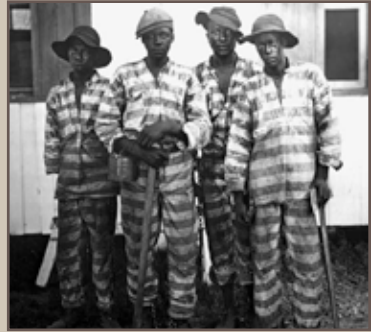
Convicts leased to harvest timber. 1910s.

interests sought to attract investment with the comparative advantage of a low-wage disenfranchised workforce. 6 These labor relations were maintained through the threat and actual use of violence. Between 1882 and 1930, black Floridians suffered the highest per capita lynching rate in the US with at least 266 killings, many linked to labor disputes. 7 Within a hardening Jim Crow racial caste system, forced labor persisted in a combination of legally sanctioned and extra-legal forms.