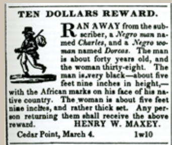
Advertisement for runaway slave.

After Great Britain gained control of Florida in 1763, South Carolina emigrant planters began developing large-scale commercial agriculture, particularly rice and indigo cultivation, along the St. John's River. Enslaved Africans and their descendents provided the main labor source during this time. Spain regained control of Florida following the American