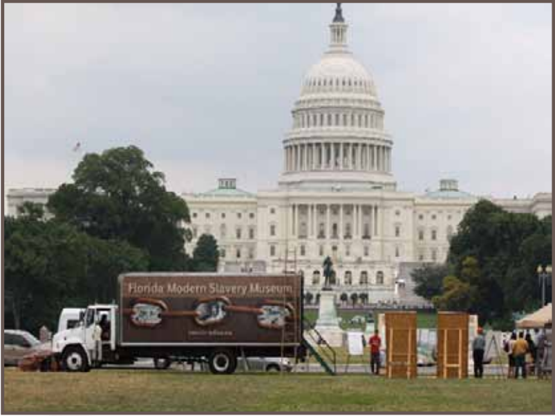
The Florida Modern-Day Slavery Museum is exhibited on the National Mall on June 14, 2010.