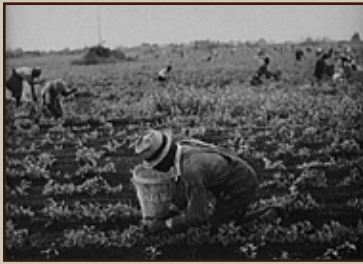
Picking beans. Belle Glade, Florida. 1937.