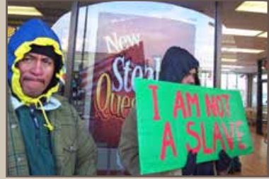
CIW members protest outside of a Taco Bell restaurant. 2002.

industry not only profit from farmworker exploitation, but actually play an active role in that exploitation by leveraging their volume purchasing power to demand ever-lower prices. 23 Lower produce prices in turn create downward pressure on farmworker wages. The Campaign for Fair Food seeks to reverse that process, enlisting the resources of retail food giants to improve farmworker wages and harnessing their demand to reward growers who respect their workers' rights.