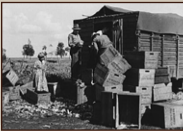
Trucker loading cabbages beside road near Belle Glade, Florida. 1939.

As the nineteenth century drew to a close, mid-Atlantic truck farmers began to sell greater quantities of fresh fruits and vegetables to urban markets. This model spread southward with the aid of rail lines and refrigeration technology, and in the 1920s, grower-shippers expanded citrus, sugarcane, and winter vegetable production in central and south Florida. These large-scale operations required a distinctly