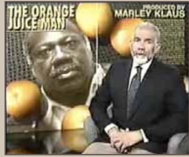
Originally aired January 3, 1993.

2010. These prosecuted cases meet the high standard of proof and definition of slavery under federal laws, including laws forbidding peonage and indentured servitude passed just after the Civil War during Reconstruction (18 U.S.C. Sections 1581-1589) and the 2000 Victims of Trafficking and Violence Protection Act. In such situations, captive workers are held against their will by their employers through threats and, all too often, the actual use of violence – including beatings, shootings, and pistol-whippings. The seven successful prosecutions resulted in the liberation of well over 1,000 farmworkers: