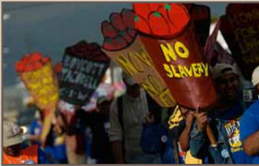
Coalition of Immokalee Workers’ march from East Los Angeles to Irvine, CA. 2004.

The Coalition of Immokalee Workers has been a leader of anti-slavery efforts in the state’s agricultural industry for more than a decade, and played a key role in the discovery and investigation of six of the seven Florida