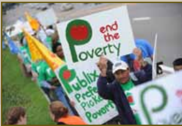
CIW members and allies march in Lakeland, Florida. 2009.

I support the Coalition’s Campaign for Fair Food, whereby corporate purchasers of tomatoes have agreed to contribute monies for the benefit of the tomato field workers. I commend these purchasers for their participation...” 24