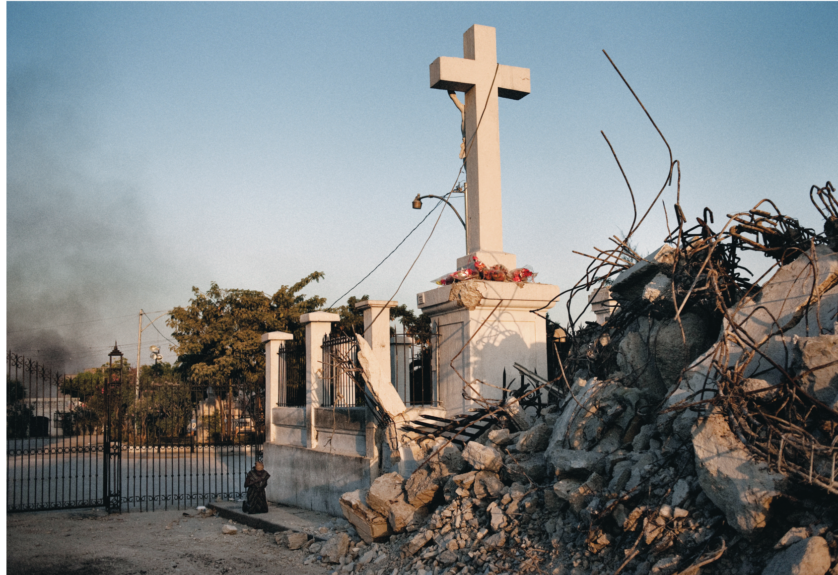
Shaken belief: Haiti, 2010. The 1755 Lisbon quake led Voltaire to question the existence an all-powerful God

And it is not God that gives meaning to our lives, but our relationships with fellow human beings and the goals and obligations that derive from them. God is at best redundant, at worst an obstruction. Why do I need him?