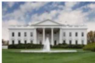
The Twenty Percent Solution: Breaking the Iranian Stalemate (2010 April 16)

President Obama's deadline to address concerns about Tehran's nuclear program passed at the end of 2009, so the White House is moving to harsher sanctions. But the U.S. is having trouble rallying the needed international support because Iranian intentions remain ambiguous