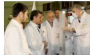
Calculating the Capacity at Fordow (2009 December 2)

FAS experts conclude that while the construction and the announcement of Iran's Fordow Fuel Enrichment Plant, does not prove an intention to deceive the International Atomic Energy Agency (IAEA), it raises troubling questions. The facility is too small for a commercial enrichment facility, raising concerns that it might be intended as a covert facility to produce highly enriched uranium for weapons.