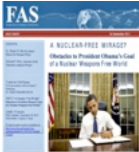
A Nuclear-Free Mirage (2011 September 26)