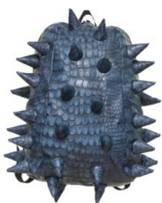
Blue By You