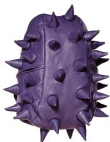
Purple People Eater