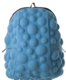
Don't Teal My Thunder