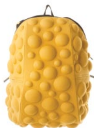
Sunny Side Up