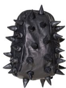
Got Your Black