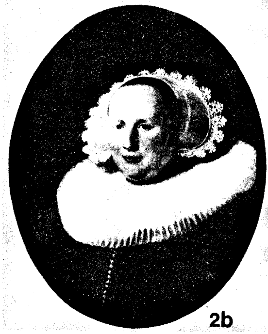
Figure 2 Two of Rembrandt's portraits. (a) Self-portrait (1653); (b) Margaretha van Bilderbeecq (1633)

suitable material for such a study: first, because there are plenty of them (produced to a rather standard pattern for rather standard ends); and, second, because the asymmetry in portraits is of a relatively simple kind which is obvious to the eye and easily classified. Portrait painters rarely paint their subjects full-face, but rather turn the head slightly to one side so that a more recognisable three-dimensional" image is produced. In so far as the painter's goal is merely to portray the physical likeness of the sitter, there would seem to be no reason for any consistent bias to turn the head to left or right. Thus we might expect that, in a sufficiently large sample, 50 per cent of the portraits would show more of the left cheek and 50 per cent more of the right. That was the "null hypothesis" with which we started. We soon found good cause to reject it.