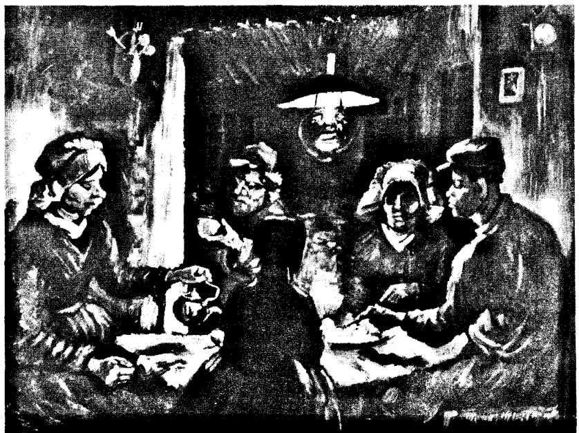
Figure 1 The Potato Eaters by Van Gogh. The original is on the top