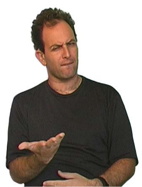
wh-question and shared information superarticulation

Figure 4. Simultaneous componential intonation (superarticulation) in Israeli Sign Language (Reprinted with permission from Meir & Sandler, in press)