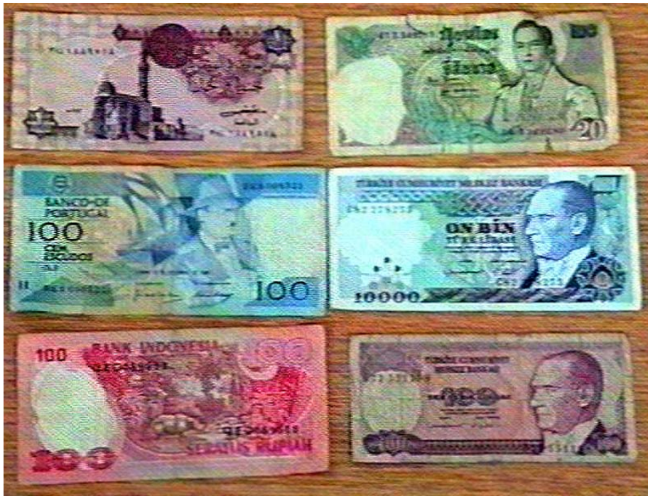
Currency from different countries which founded at battle field in Bosnia