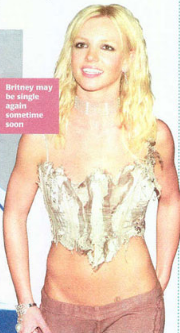
Britney may be single again sometime soon