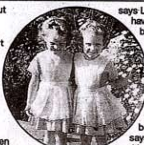
BOND: As children

"Our psychic skills are definitely heightened when we work together,"